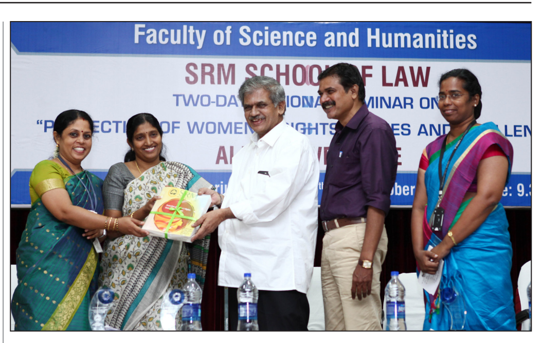
The Dean, School of Law, Felicitating the Chief Guest