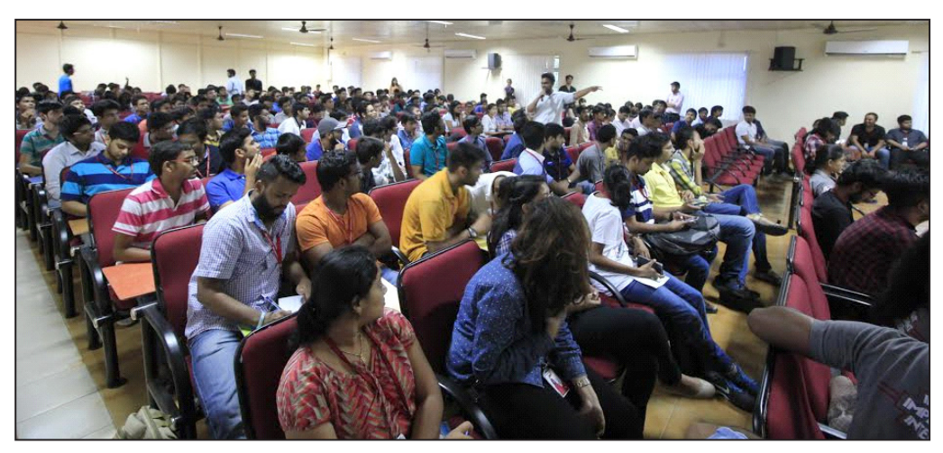
Participants racking their brains for the right answer