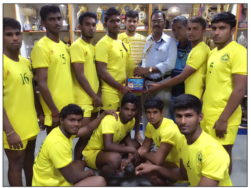
SRM Kabaddi Team won State level Open Tournament