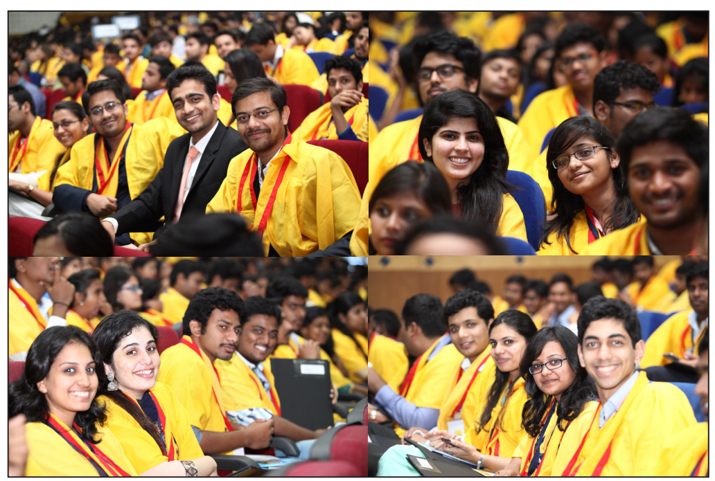
Scenes from the Convocation'16