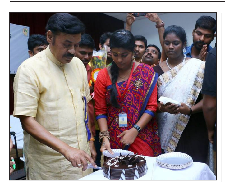
Chancellor celebrating his birthday with students.