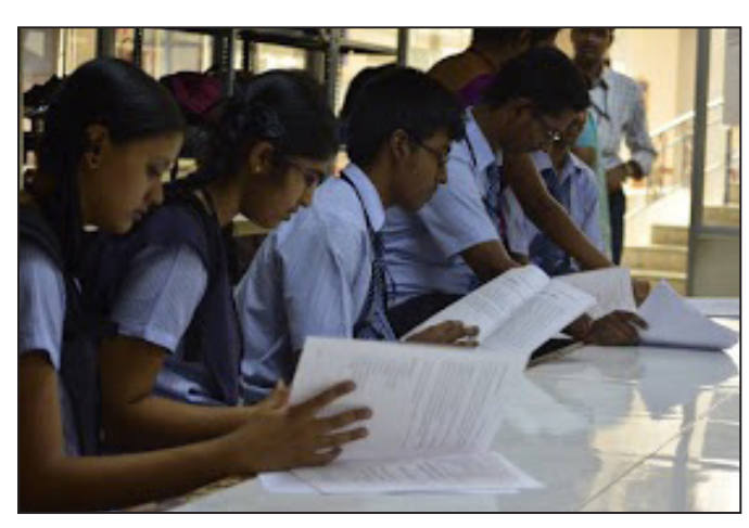
Students taking the Biology Talent Search Exam

On the 7th of September a Biology Talent search exam was conducted, for higher secondary level students to test their reasoning abilities in the field of biology. The following day, a science exhibit by the SRM