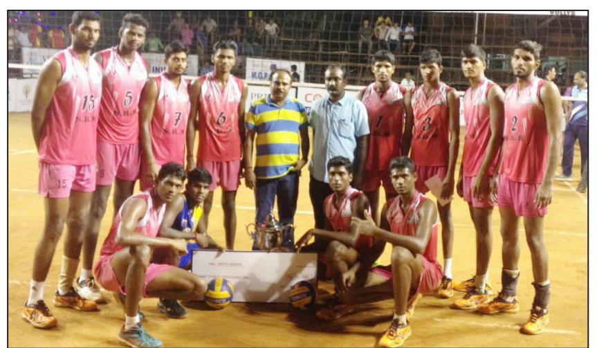
SRM Volleyball men Team won vollys Trophy