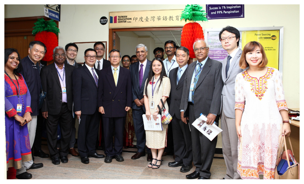
Delegates from National Tsing Hua University along with VC, SRM University

The Taiwan Education Centre is seen as an academic platform