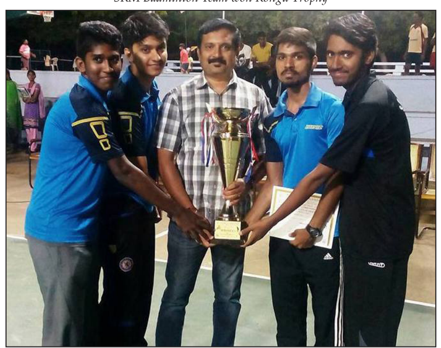
SRM Table Tennis Team won Kongu Trophy