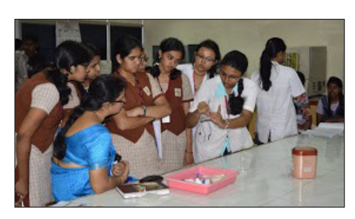
The S2C Exhibit

School Science Congress was organized. Around 35 three-membered teams participated in the event and presented various projects on environmental sciences, health sciences and life sciences using working and non-working models. The last event, held on the 9th of September, was a workshop on DNA. Quality and quantity analysis of DNA and isolation of DNA from blood were the main highlights of this event. Students were also allowed to