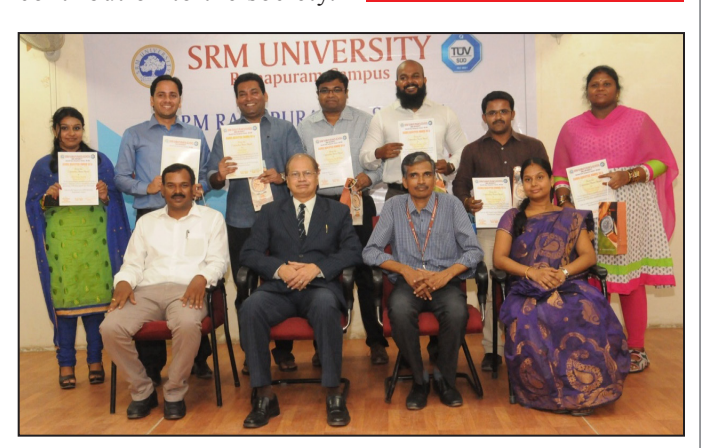
The alumni of Ramapuram B-School