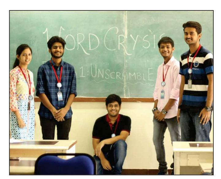
Students at the fest