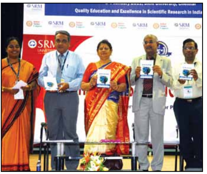
The Registrar (Second from Right) at the Valedictory ceremony