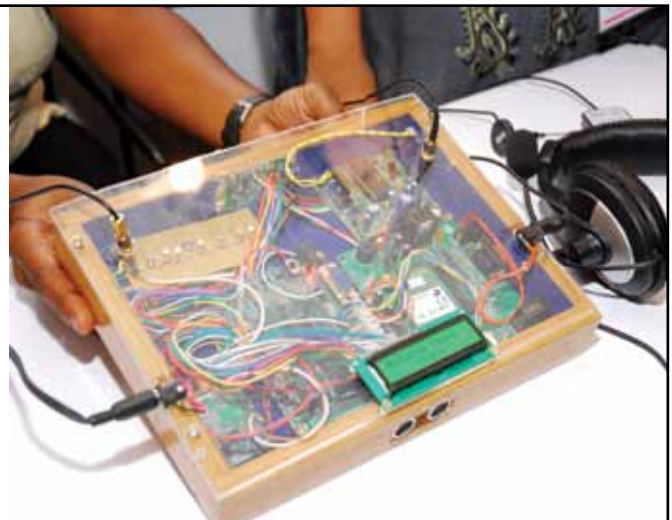
The prototype of the device

The device uses Global Positioning System (GPS) and the Zigbee modules that are combined in such a way so as to identify the landmarks. A few basics would have to be borne in mind in order to come to terms with the requisite technology: What is the blind person's current location; What