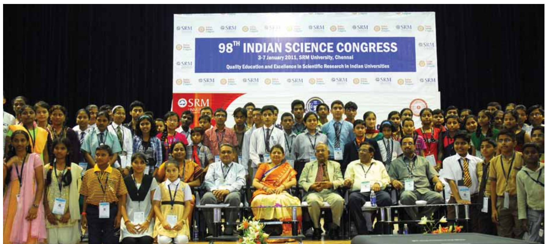
The valediction of the Children Science Congress