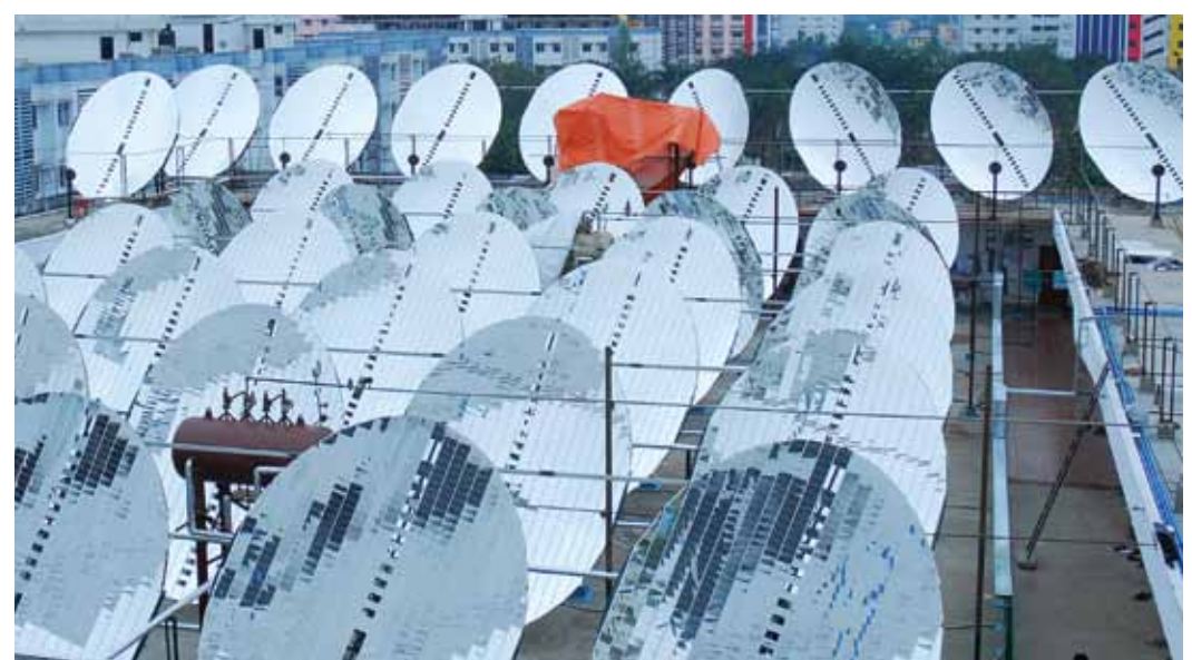
Solar panels for heating water