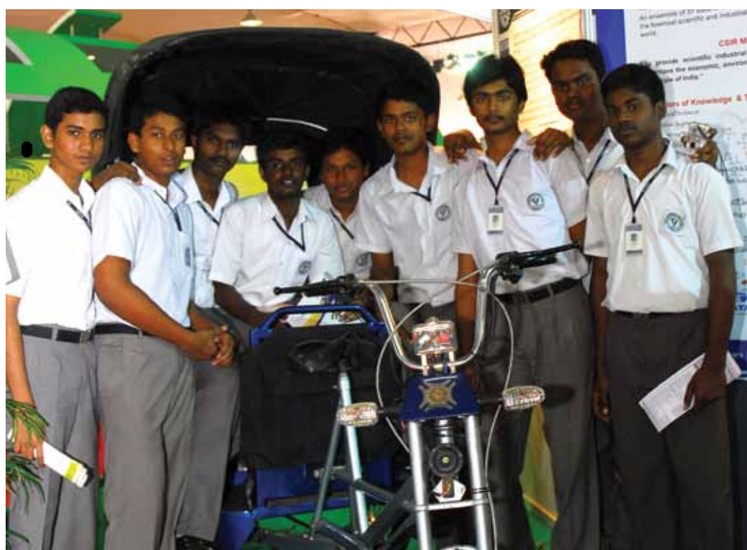
High School students at the science exhibition