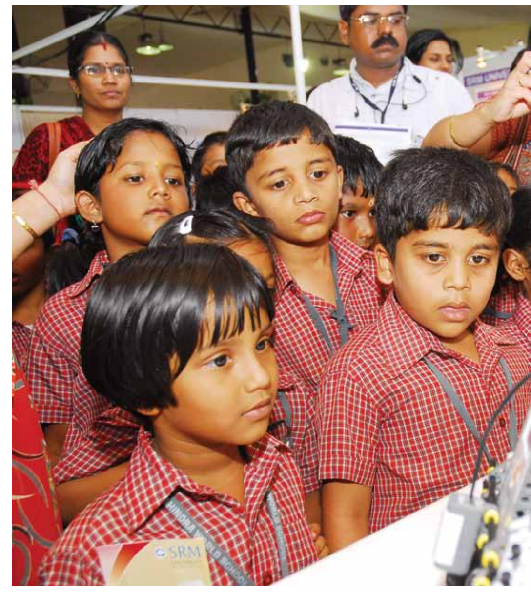
The future of India at the Science Ex