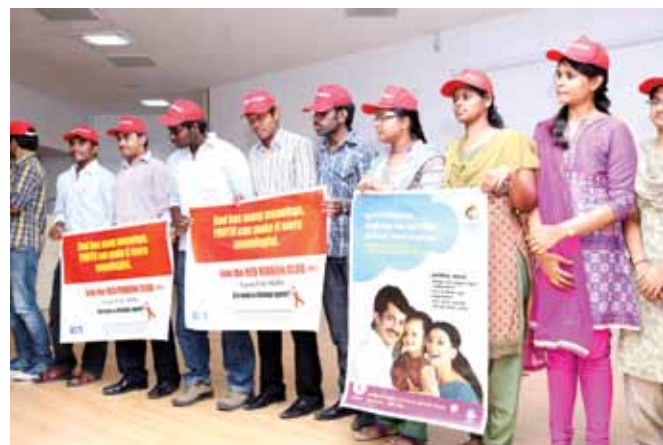
Students highlighting HIV-AIDS

Although a cure for AIDS still hasn't been found, educating and raising awareness about such an important topic contributes