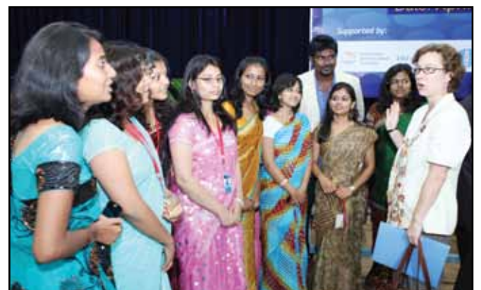
The Consul General of the United States of America in Chennai interacting with Journalism Students.