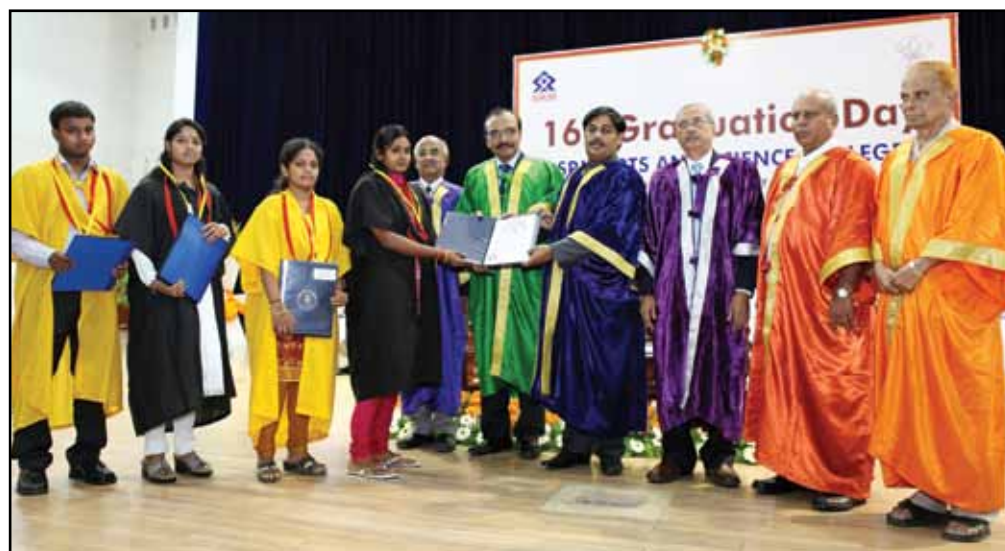
The Chairman of SRM Group of Institutions and the Chief Guest with the toppers.

“Life is no resting even for a person who has achieved success and to maintain such success one must always be on the go. Professional ethics, integrity sterling character and values are some of the virtues that are