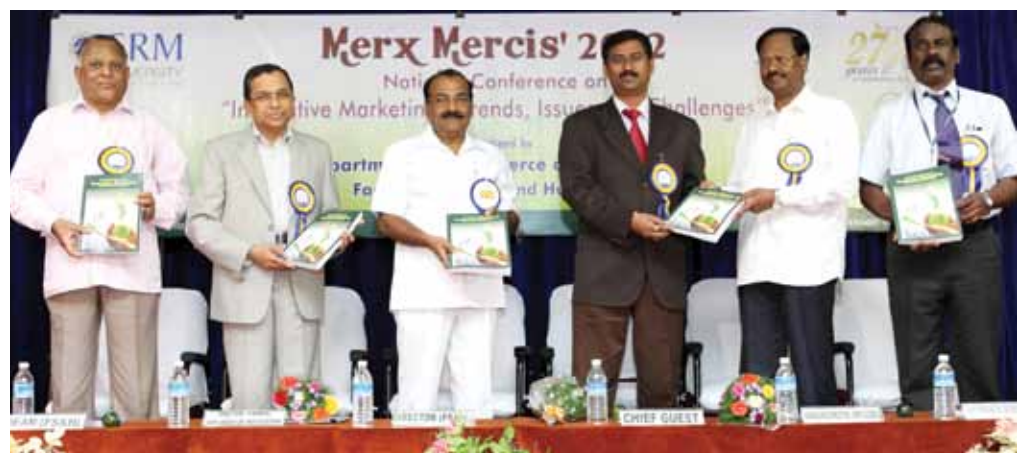
The Director of the Faculty of Science and Humanities and other dignitaries at the release of the proceedings.