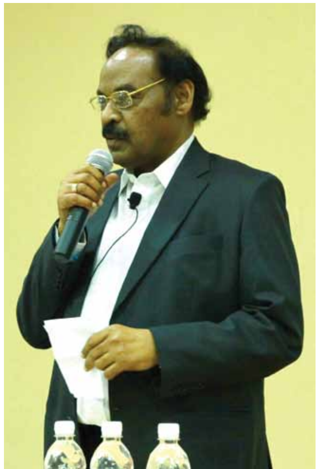
Recently the Chancellor of SRM University visited Singapore where he addressed students and faculty of the Management Development Institute of Singapore (MDIS)