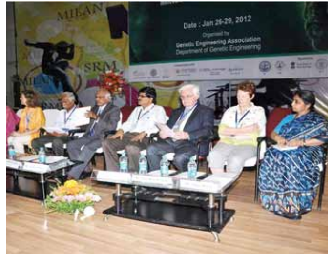
The Participants at the event

The conference was divided into eight segments, which covered a myriad of topics. The various sessions of the conference had speakers from all over the country and many from USA delivering lectures on a wide