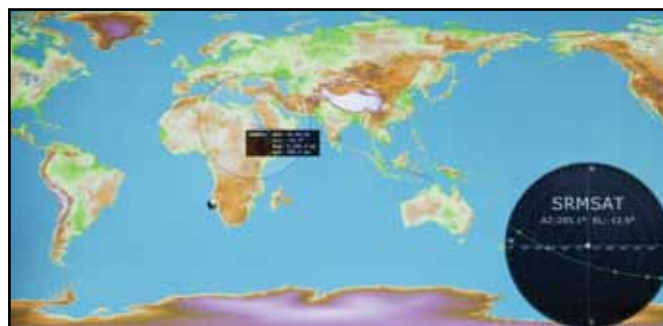
Image from the Tracking Station at University Building, SRM University.

During the 15 minute long pass, an antenna mounted on top of the GS aligns itself to get a good signal which is then recorded. 'We hear a series of beeping which is in Morse code and when decoded, it generally gives SRMVUCZZPXC. Each letter stands for a parameter