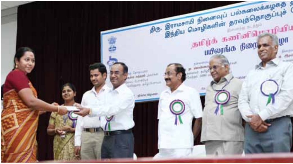
பயிலரங்கில் பங்கேற்றவருக்குச் சான்றிதழ் வழங்கப்படுகிறது.

கணினித்தமிழ்த் துறையில் மிகுதியான மனித வளங்களை உருவாக்கும் சீரிய நோக்கத்தோடு திரு. இராமசாமி நினைவுப் பல்கலைக்கழகத் தமிழ்ப் பேராயத்தின் (Thamizh Academy) கணினித்தமிழ்க் கல்வித்துறை (Computational Tamil Studies), இந்திய மொழிகளின் நடுவண் நிறுவனத்தின் மொழித் தரவுத்தொகுப்புச் சேர்த்தியத்துடன் (Linguistics Data Consortium for Indian Languages) இணைந்து 20.1.2012 முதல் 30.1.2012வரை SRM பல்கலைக்கழகக் காட்டாங்குளத்தார் வளாகத்தில், தமிழ்க் கணினிமொழியியல் Tamil Computational Linguistics எனும் வரலாற்றுச் சிறப்புமிக்க பயிலரங்கினை நடத்தியது.