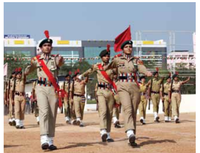
The march past by Cadets

"Parents, teachers and students all have to work hand-in-hand to shape the future of the students", said Lt.