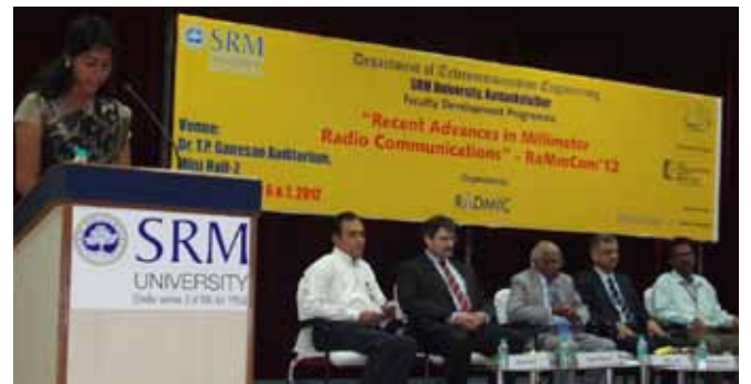
The Conference in progress

In today’s world, ‘WIRELESS’ is the new buzz and landscape of Wireless Communications is changing rapidly. The last few years have seen a growth in the demand for wireless broadband access. The reason for this growth can be seen as the emergence of multimedia applications, demands for ubiquitous high-speed Internet connectivity, the massive growth in the mobile & wireless communications and the deregulation in the telecommunications industry. Recently, applications of Millimeter waves (at 60 GHz) for high-speed broadband Wireless Local Area Networks and Wireless Personal Area Network communication systems such as multimedia equipment, home appliances, video signal transmissions, file downloading and personal computers in indoor environment are increasingly gaining importance. In view of these developments and importance, the Department of Telecommunications Engineering conducted a two day faculty development programme on ‘Recent Advances in Millimeter Radio Communications - RaMmCom’. Around 60 M.Tech