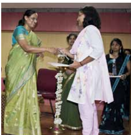
Chief Guest Distributing the Prizes

The Chief Guest addressed the gathering on various placement opportunities available in the public sector and motivated the students to take UPSC exams such as civil engineering services. She also threw light on the topic ‘Humanity in Engineering’ and delivered an motivating speech