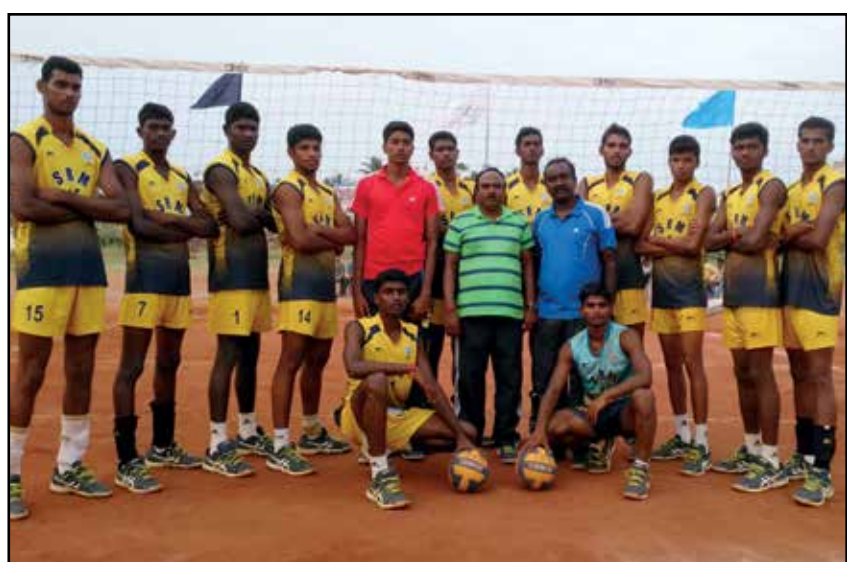
SRM Men Volleyball team won South Zone inter University Tournament at Andhra University, Visakapattinam