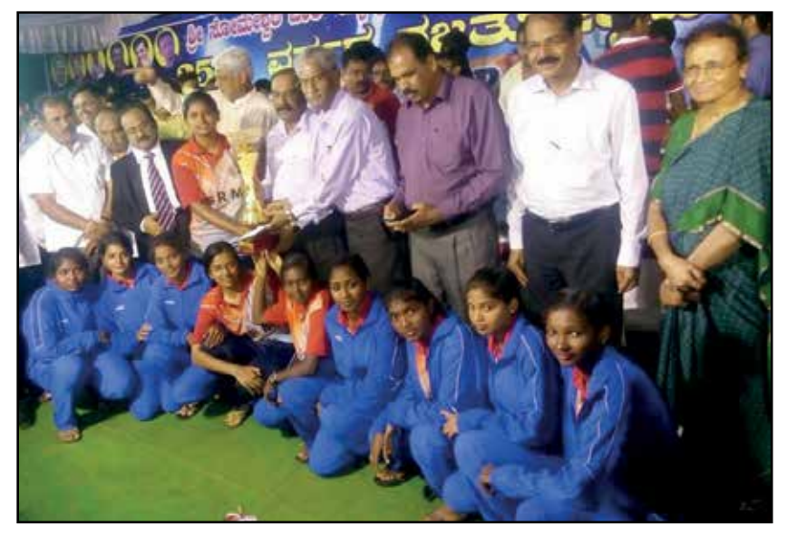
SRM Women Ball Badminton Team won CM trophy at Tumkur