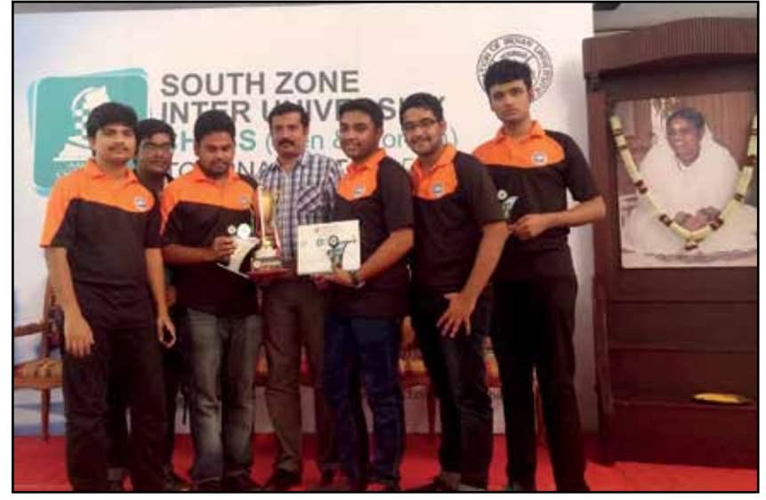
SRM Chess team won 2nd Place in South Zone inter University Tournament at Amirtha University, Coimbatore