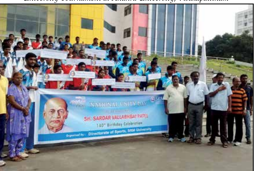
The Directorate of Sports Celeberated National Unity Day, at SRM University, Kattankulathur