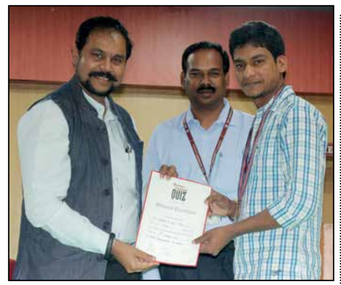
Guest speaker distributing certificates to the winners in business quiz conducted by SRM Ramapuram B -School in association with Business standard.