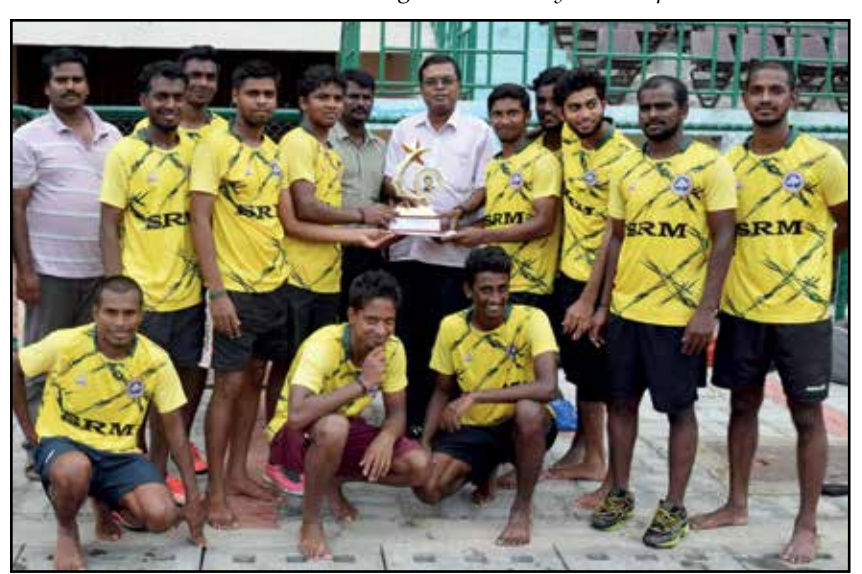
SRM Men Hockey Team won Tamilnadu inter Deemed University Tournament at SRM University