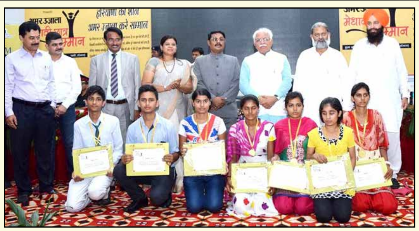
District toppers in 12th board are presented with medal and certificate by The Chief Minister of Haryana