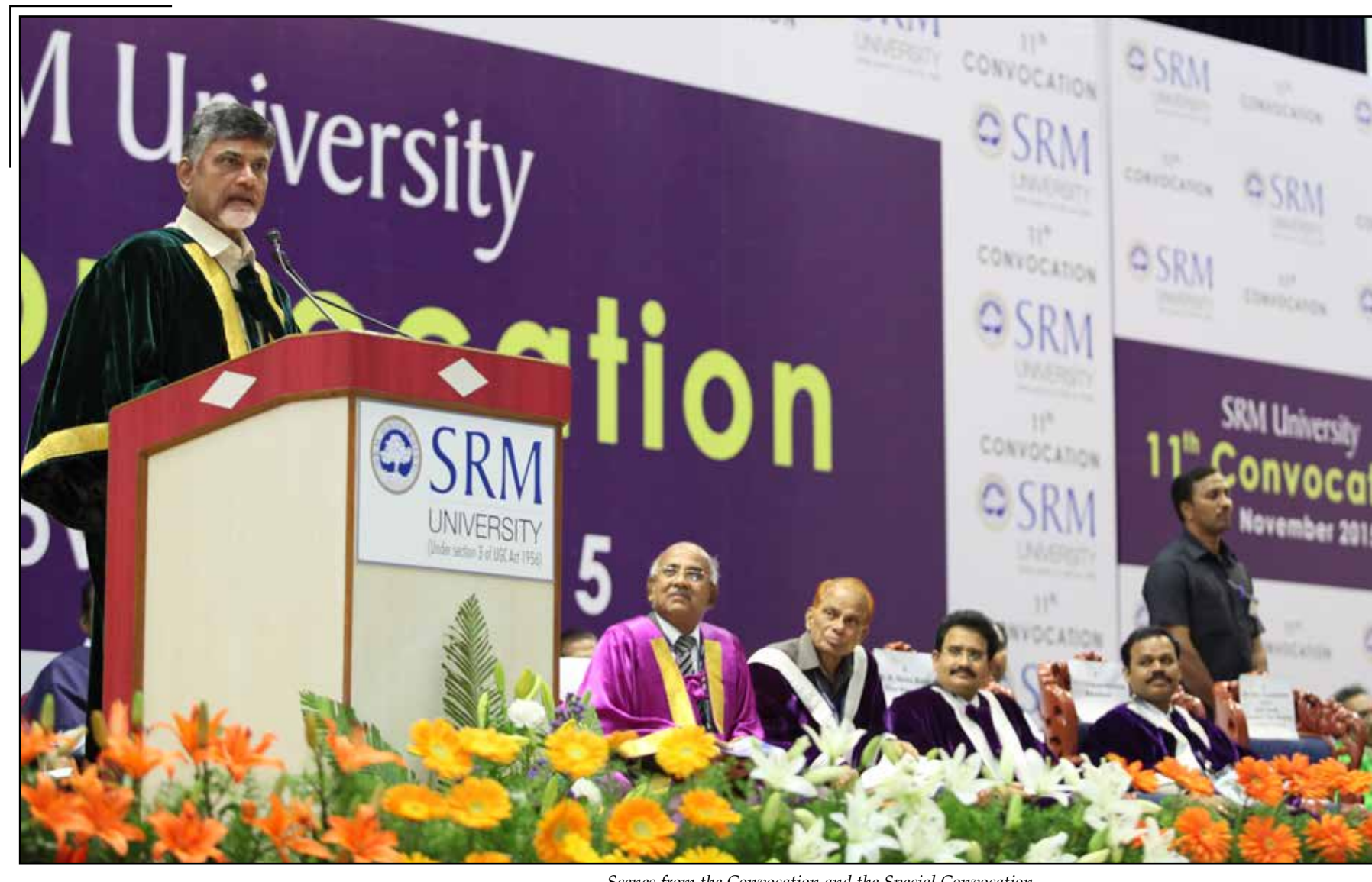
Scenes from the Convocation and the Special Convocation