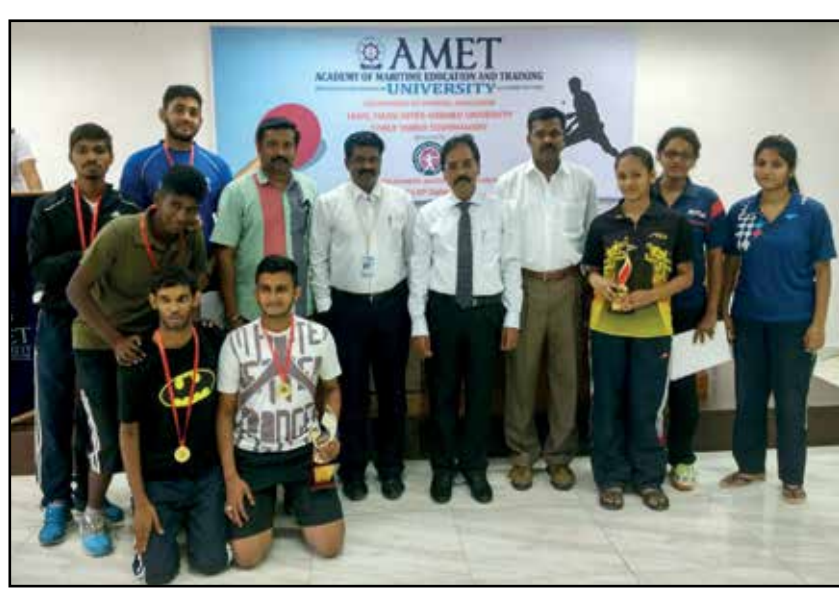
SRM Men and Women Tabel Tennis Team won Tamil Nadu Inter Deemed University Tournament at Sastra University, Tanjore