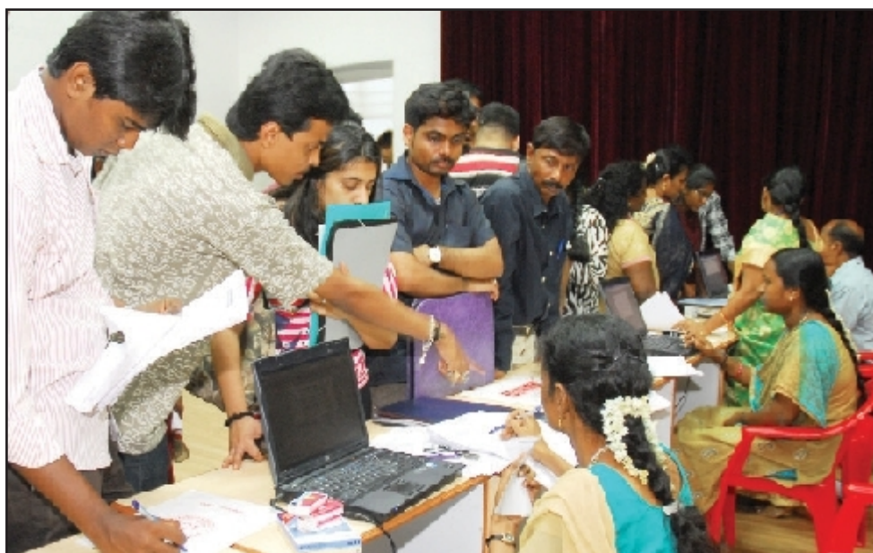
Entering student data into ERP system.