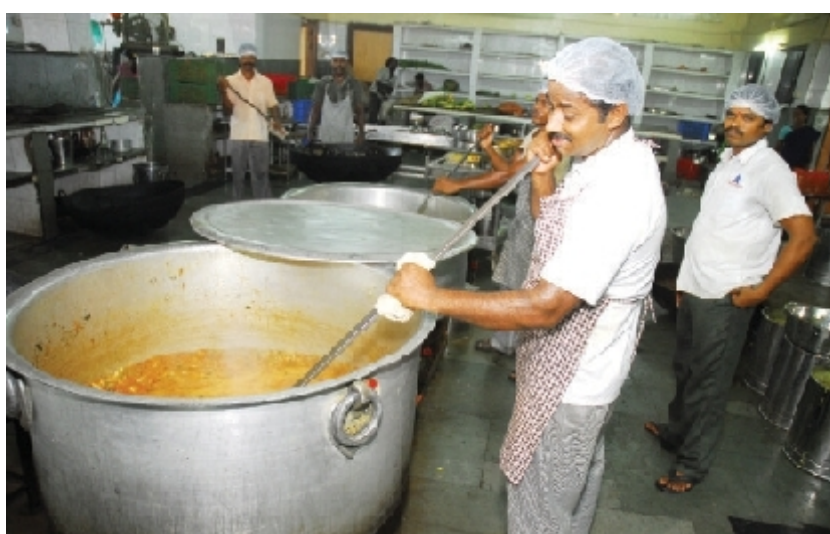
Preparing a curry