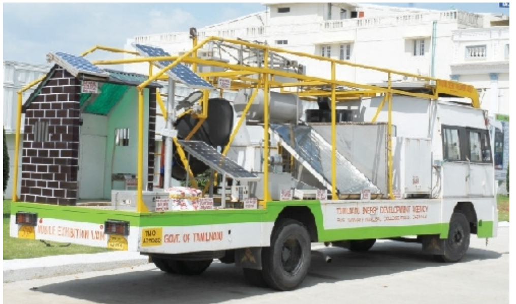
Tamilnadu Energy Development Agency exhibiting a mobile solar heater.

What got the attention of the enthusiastic audience was the High-Speed Unmanned Ground Vehicle designed by the Central Vehicle Research and Development Establishment (CVRDE), Avadi.