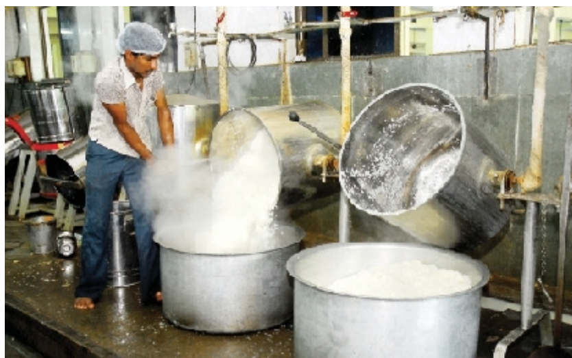
Rice cooking in progress