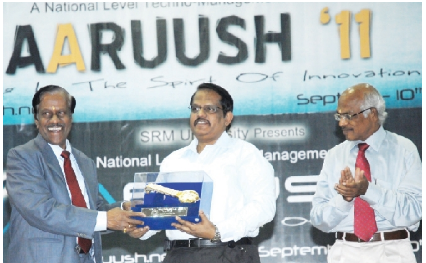
The Vice-Chancellor presenting a memento to the Chief Guest with the Pro-Vice Chancellor looking on.

was fitted with a Maruti 800 cc car engine that could touch a speed of about 110 kmph.