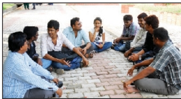
The Reader's club session in progress