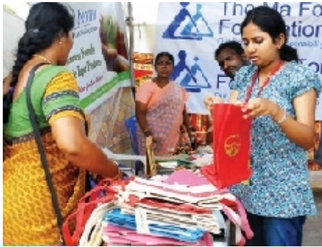
A student busy at the stall during Aaruush

Stalls with clothes, bags and gift items were also jam-packed. A few stalls promoting several schools and organizations like Spaceterior, for interior design and PETA, to stop abuse against animals received a lot of interest.