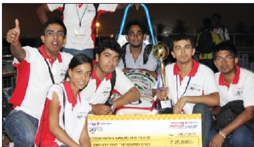
Camber Racing team.

"The SRM Camber racing team was the only team to breeze through the initial inspection hassle-free by complying cent per cent with the rule book."