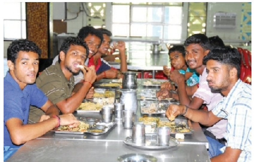
Students enjoying their food