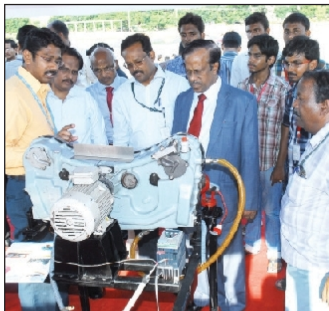
The Chief Guest and the Vice-Chancellor expressing keen interest in the vehicles designed by SRM University students

“ I would love to come back next year and win more prizes ”