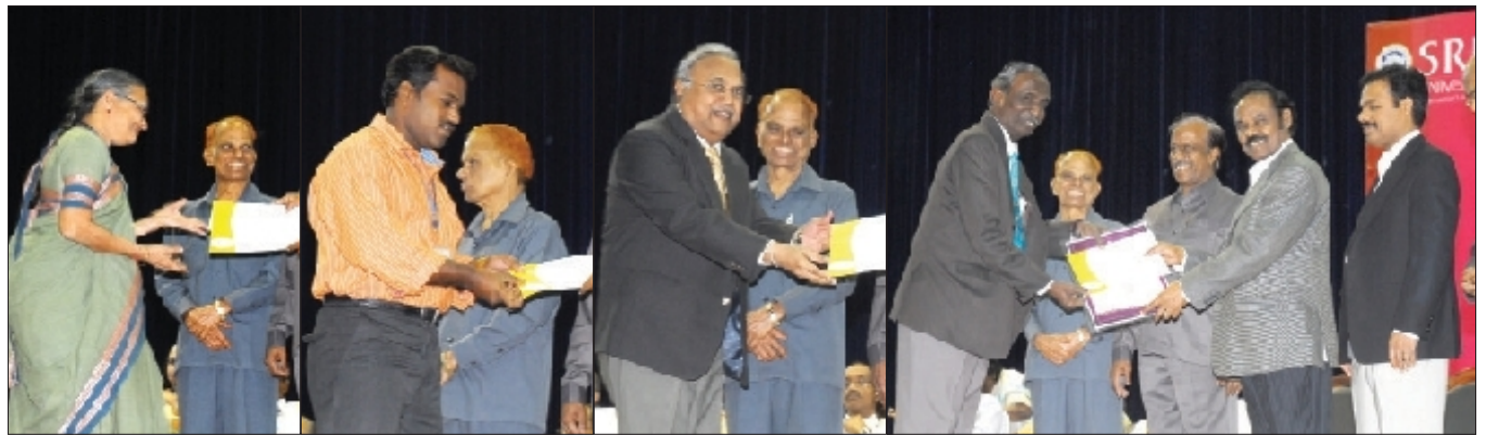
A section of the teaching community led by the Vice-Chancellor being honoured by the Chancellor and President.

SRM give great value to our teachers. They are our asset" the President said adding that for the sake of the students the teaching community would have to "work harder".