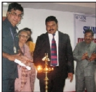
Inaugurating the training camp.