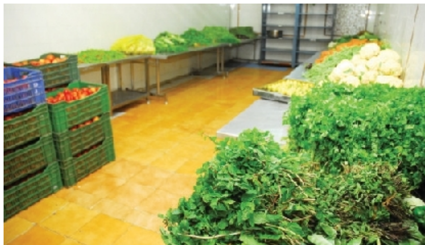
A Vegetable store room