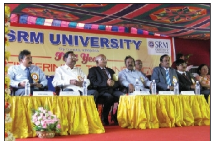
Chancellor welcomes new engineering students

The organisers plan to conduct similar camps at other universities in India and provide seed fund to those ideas that provide sustainable and viable solutions.