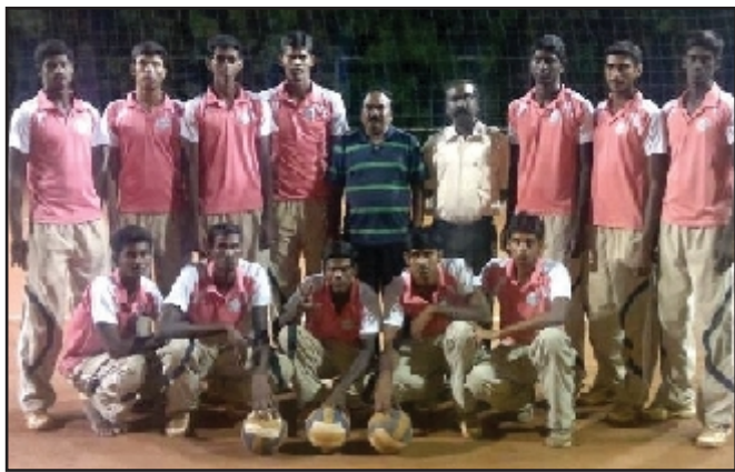
The winning Volleyball team