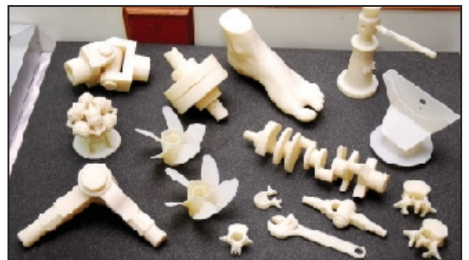
Left : The rapid prototyping machine; Top : Machine that calculates the dimensions; Below : 3 D models.

machine costs close to ₹ 1.2 crore and is complemented by a second machine (approx. ₹ 75 lakh). It is used to calculate the dimensions of an object in case the details are not known or available. Here, the object in question is scanned and the RPT machine makes a replica using the calculated dimensions.