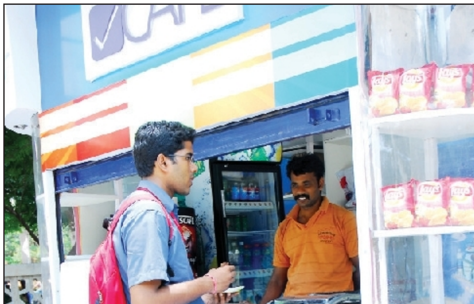
A student having a sandwich