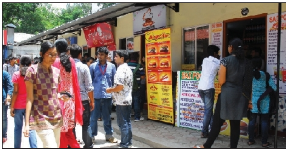
New shops at Food Court