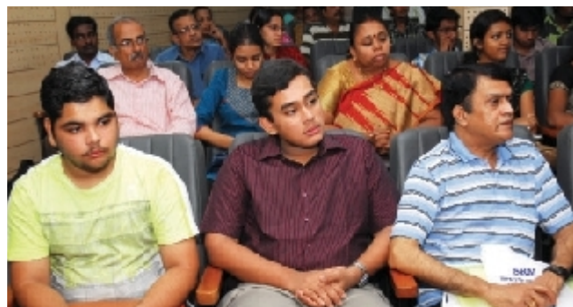
Parents and students at Vadapalani Induction ceremony

Further, he said, "We will organise weekly lectures from industry experts, experts from Institute of Chartered Accountancy, and experts from the banking field and the corporate world. Apart from this the students can also visit the Kattankulathur campus in the weekend to get exposure to the technology used there."