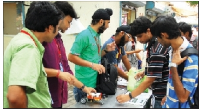
Students registering for Robogyan

More mainstream events like Man O Maze had participants maneuvering their bots around a maze in a specified amount of time and in Robodrive where robots