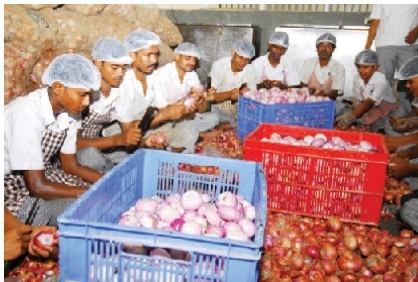
Sorting the onions