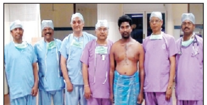
SRM Doctors with the patient

Edited and Published by : The Department of Journalism and Mass Communication , Faculty of Science and Humanities, SRM University, Kattankulathur., Kancheepuram Dist. Tamil Nadu. Ph : 044-27452270. Printed at : SRM Publications (P) Ltd. , 211/2, East Potheri village st., Kattankulathur-603 203.