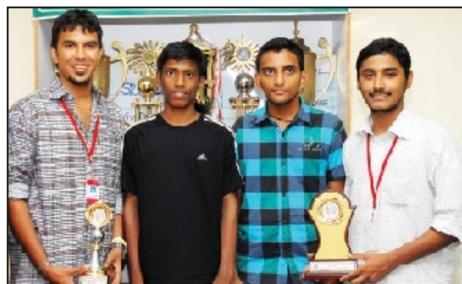
The winning TT Players