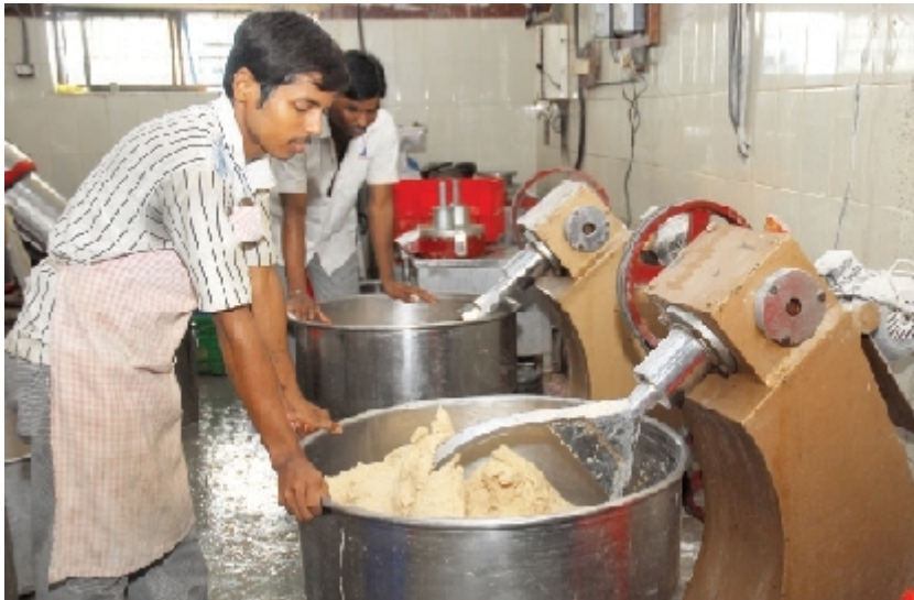
Kneading wheat dough

Sannasi Mess kitchen alone uses 40 LPG commercial gas cylinders every day to ignite 18 burners and six tawas to prepare food.