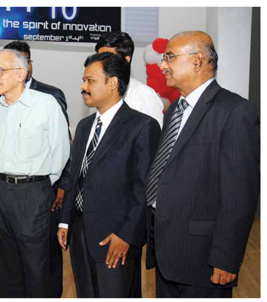
acting with organisers and students at the inaugural function along with he Registrar. Below : scenes from the festivities