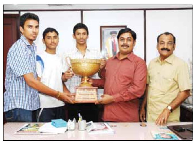
The Pro-Chancellor and the Director of the Faculty of Science and Humanities and Sports with Table Tennis men's team, the winners of the Kongu Trophy.