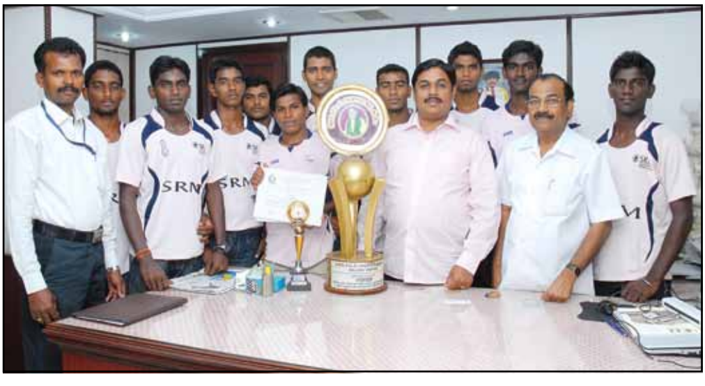
The Pro-Chancellor and the Director of the Faculty of Science and Humanities and Sports with the winning Hockey team

SRM Basketball Men and Volleyball women are Runners up, Badminton men 3rd Place