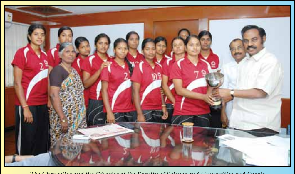
The Chancellor and the Director of the Faculty of Science and Humanities and Sports with the volleyball women's team runners up at the Kongu and Karunya Tournament