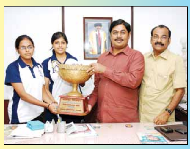
The Pro-Chancellor and the Director of the Faculty of Science and Humanities and Sports with women badminton winners