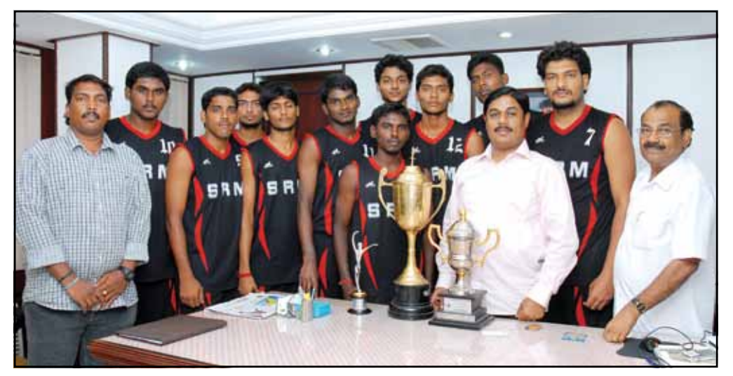
The Pro-Chancellor and the Director of the Faculty of Science and Humanities and Sports with the basketball men's team, the runners up at the Kongu and Karunya Tournaments