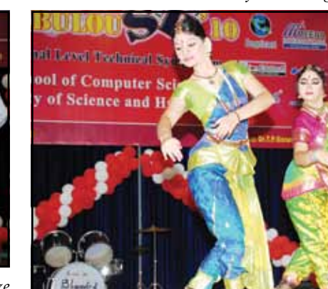
Cultural Show at the event