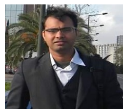
Dr. Krishna Pada Das Mahadevananda Mahavidyalaya,