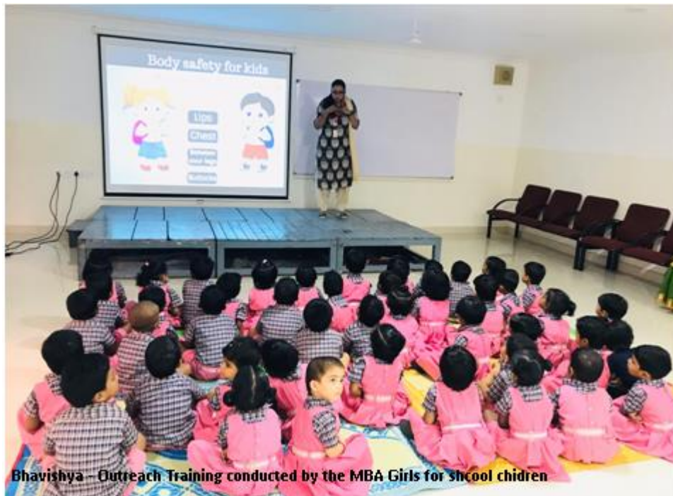
Bhavishya – Outreach Training conducted by the MBA Girls for school children