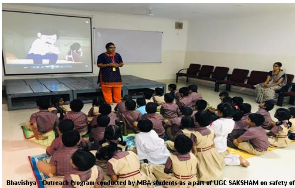
Bhavishya – Outreach Program conducted by MBA students as a part of UGC SAKSHAM on safety of girl child.