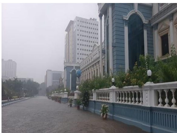
SRMIST Rainwater fed into Vallanchery

SRMIST follows Rural Traditional Kudimaramathu techniques to maintain sustainable water infrastructure. SRM Water Mission with National Water Mission educates and motivates the campus water users. SRMIST follows catch the water where it falls and gate trap constructed to harvest surface run-off sustainable smart water management system stored in reservoirs / domestic sumps, recharge open wells and constructed underground tanks. The constructed embankments are surplus structures direct excess water to the next canals and finally flow down to Vallanchery.