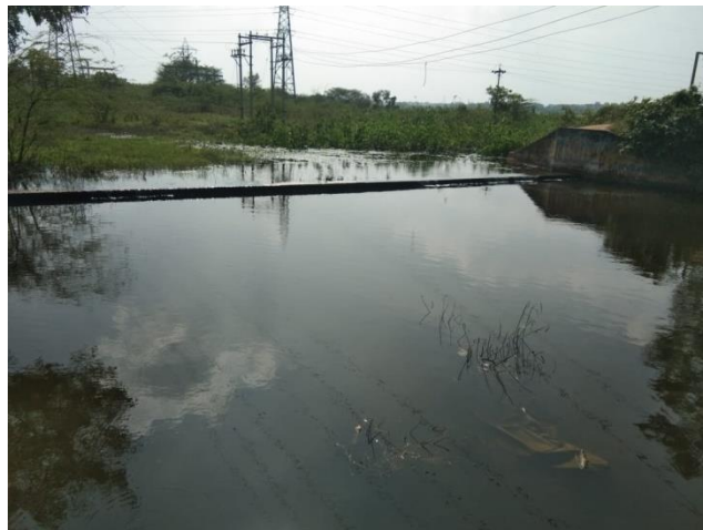
SRMIST Rainwater fed into Vallanchery