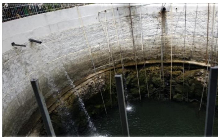
Surface Runoff Rain Water Harvesting

SRM IST Water Mission - Neer Melanmai Kudimaramathu Link for videos: