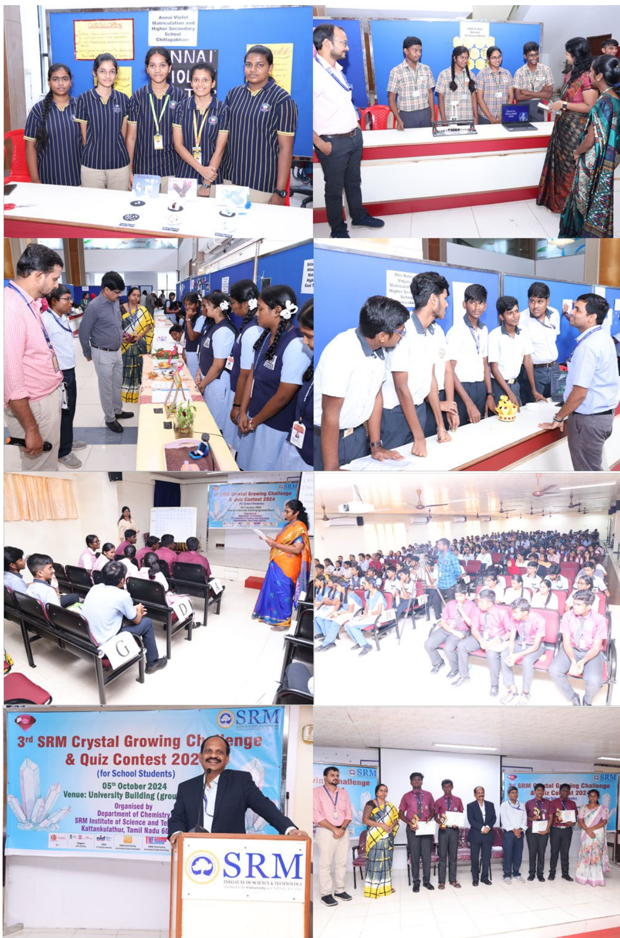
Some glimpses of various events – the exhibition of crystals, quiz contest, valedictory function, distribution of certificates and mementos.