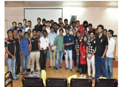
↓ THE CONRODS ALUMNI

→ Alumni Meet'17 of Vadapalani campus was held on 26th January 2017 at Vadapalani Campus Auditorium. Heads of various departments and many faculty members were present at the meet. More than 100 alumni from different batches of Vadapalani campus gathered.