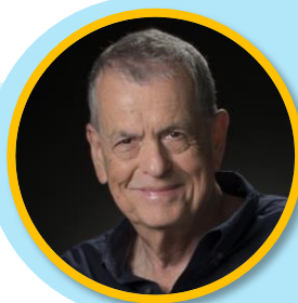
Prof. Aaron Ciechanover

Nobel Laureate in Chemistry-2004 Distinguished Technion Research Professor