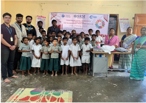
Our Organizers with Students