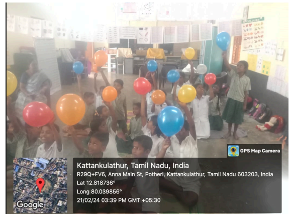
Fun Activity with Students