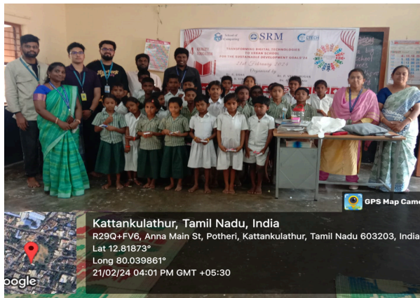
Group Photo with Students