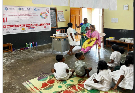
Faculties teaching digital technology to students