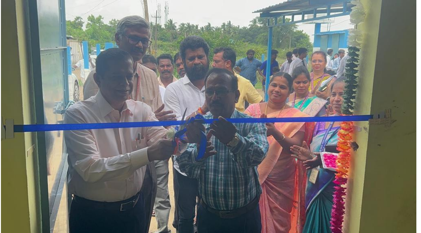
Inauguration of Cream Separator, Bulk Milk Cooler, Paneer Pressing Machine