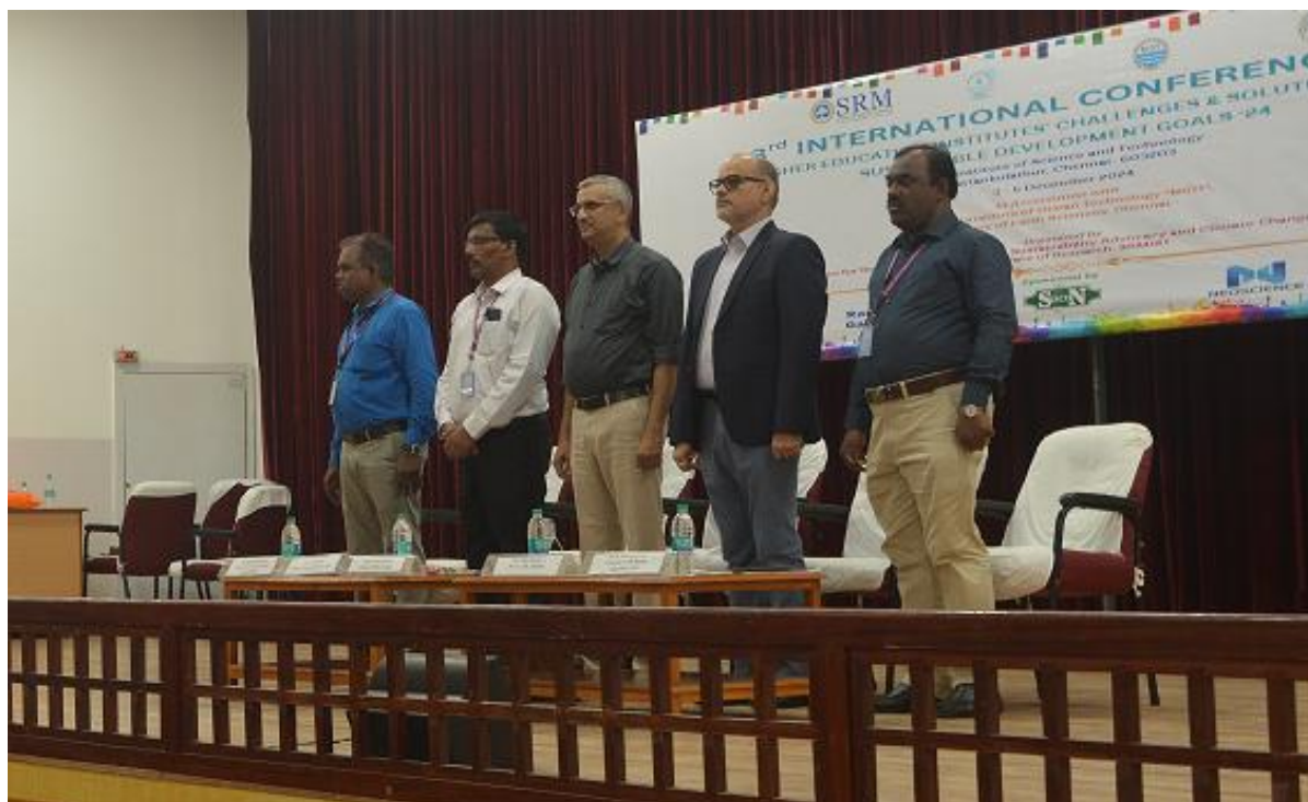
The National Conference on SDG 10: Reduced Inequalities in Education held at SRM Institute of Science and Technology (SRMIST) on December 4, 2024