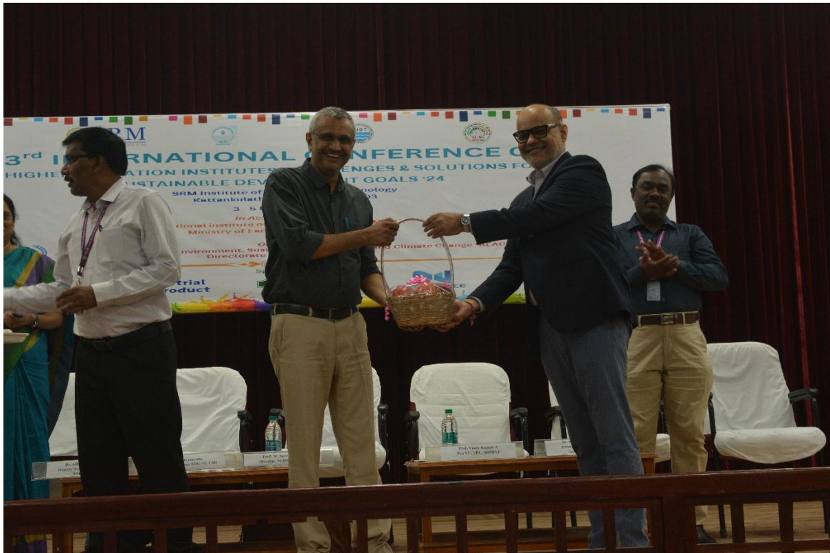
Pro-Vice Chancellor Honouring the Chief Guest