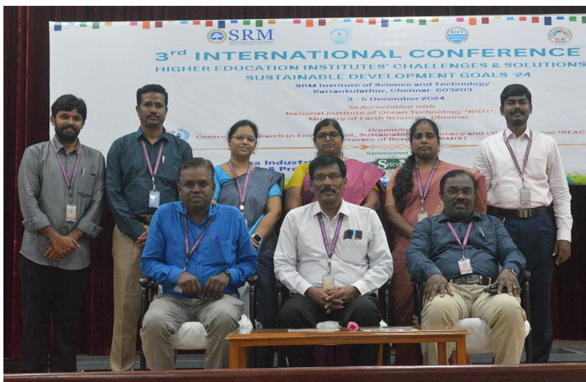
National Conference on SDG10: Inequalities in Education Valedictory Session