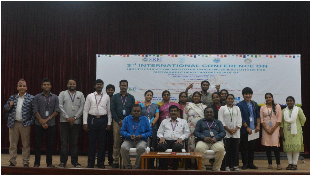
National Conference on SDG10: Inequalities in Education Valedictory Session