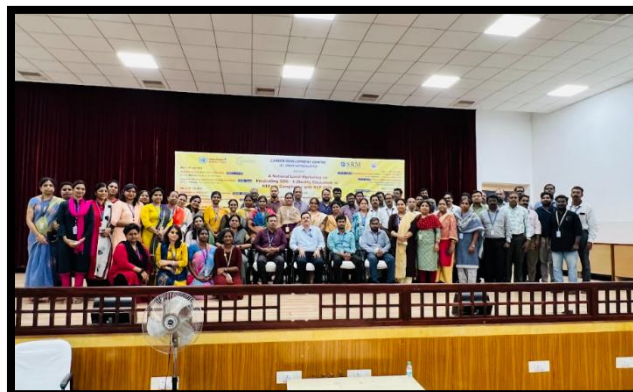
P10- Valedictory function of the SDG 4- Quality Education Programme