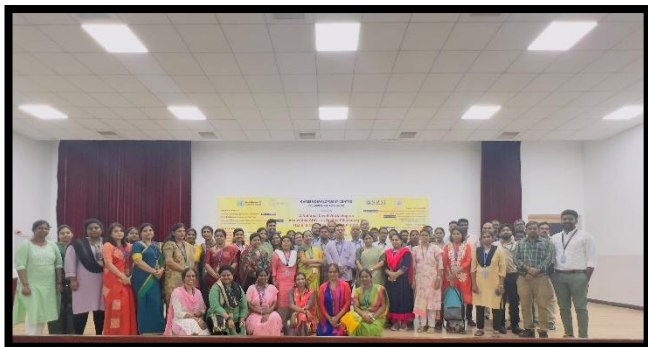
P1- Inauguration Ceremony of the Workshop