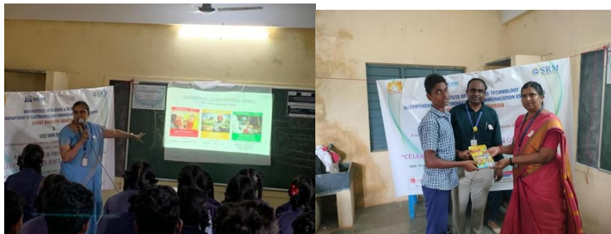
Invited speakers felicitated by Convener – SDG 5

Department of Electronics and Communication Engineering