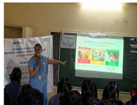
School of Electrical and Electronics organized Gender Equality Awareness Rally followed by awareness program on promote safe digital ecosystem for Women Safai Karam Charis. rural government high school community to educate the young generation about gender equality