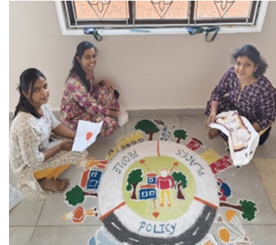
School of Public Health & Faculty of Science and Humanities conducted various activities among school and college students