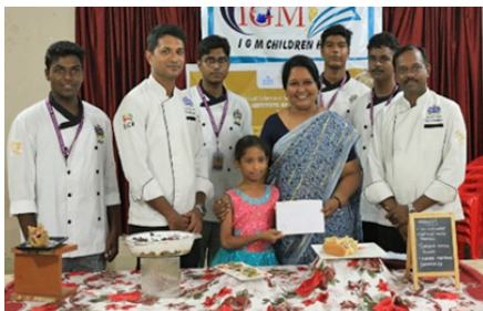
Institute of Hotel Management conducted Skill Development Program & served food for children in IGM Children's Home