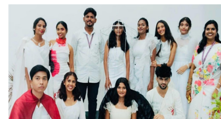
School of Law conducted rally on “Promoting LGBTQ+ Rights and Inclusion” and Fashion Ramp Walk on valedictory