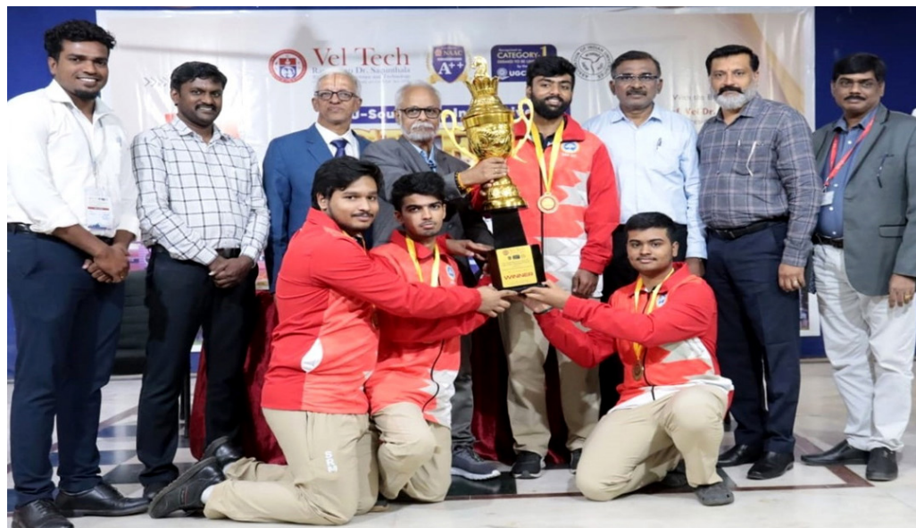
SRMIST Men's Chess team won the GOLD medal at the South Zone Inter-University Chess Tournament for Men 2025.

Winning a gold medal in chess requires a blend of advanced preparation, strategic mastery, and mental fortitude. Players must cultivate a deep understanding of opening theories, middle-game strategies, and endgame techniques to outmanoeuvre opponents across all phases of the game. Regular practice with diverse opponents and solving tactical puzzles sharpens pattern recognition and calculation speed, both of which are essential in high-pressure games.