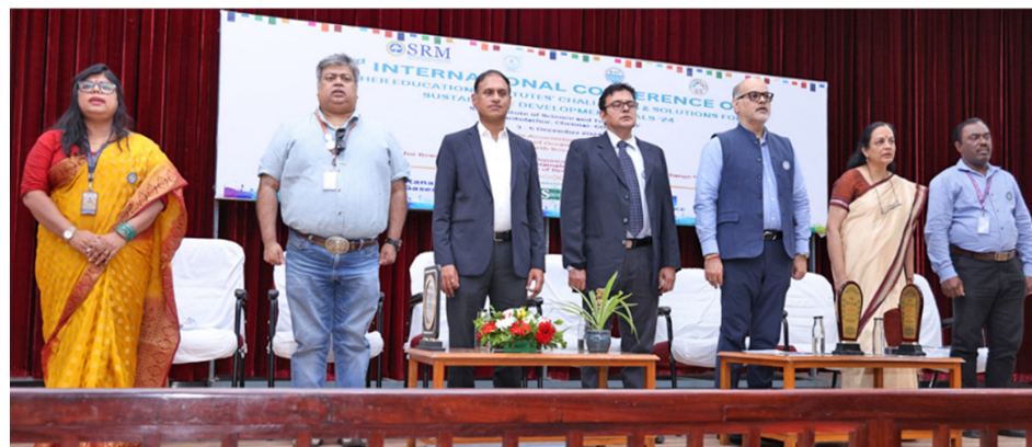
ICSDG 2024 valedictory function with respective delegates

In ICSDG 2024 students' presentations were organized in association with the