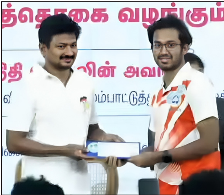
SRMIST athlete receiving a cash award from Tamil Nadu Sports Minister Udhyanithi Stalin