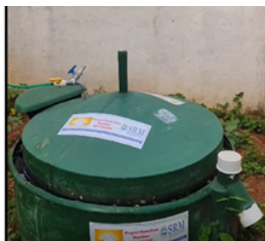
Installation of UBA funded Biogas production plant using biowaste in Kalivanthapattu