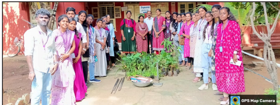
A total of 100 tree saplings were planted during the event.