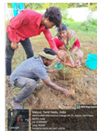
Tree planting campaign in SRM Rural Healthcare Centre, Mamandur village on 4th June 2024 as part of World Environment Day 2024