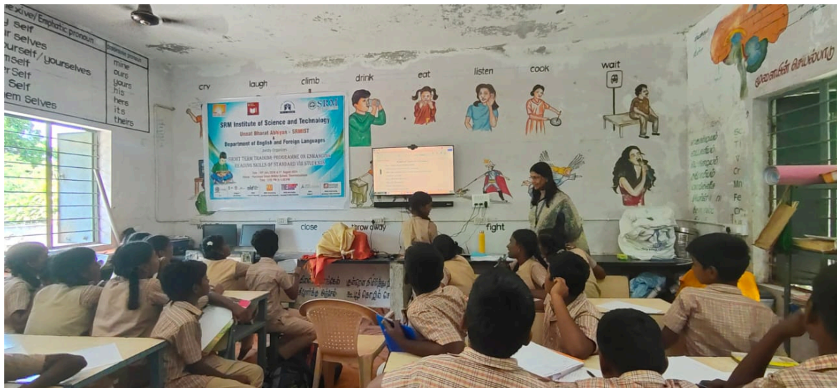
Day - 1 - Understanding the exam instructions - The resource person interacting with the students