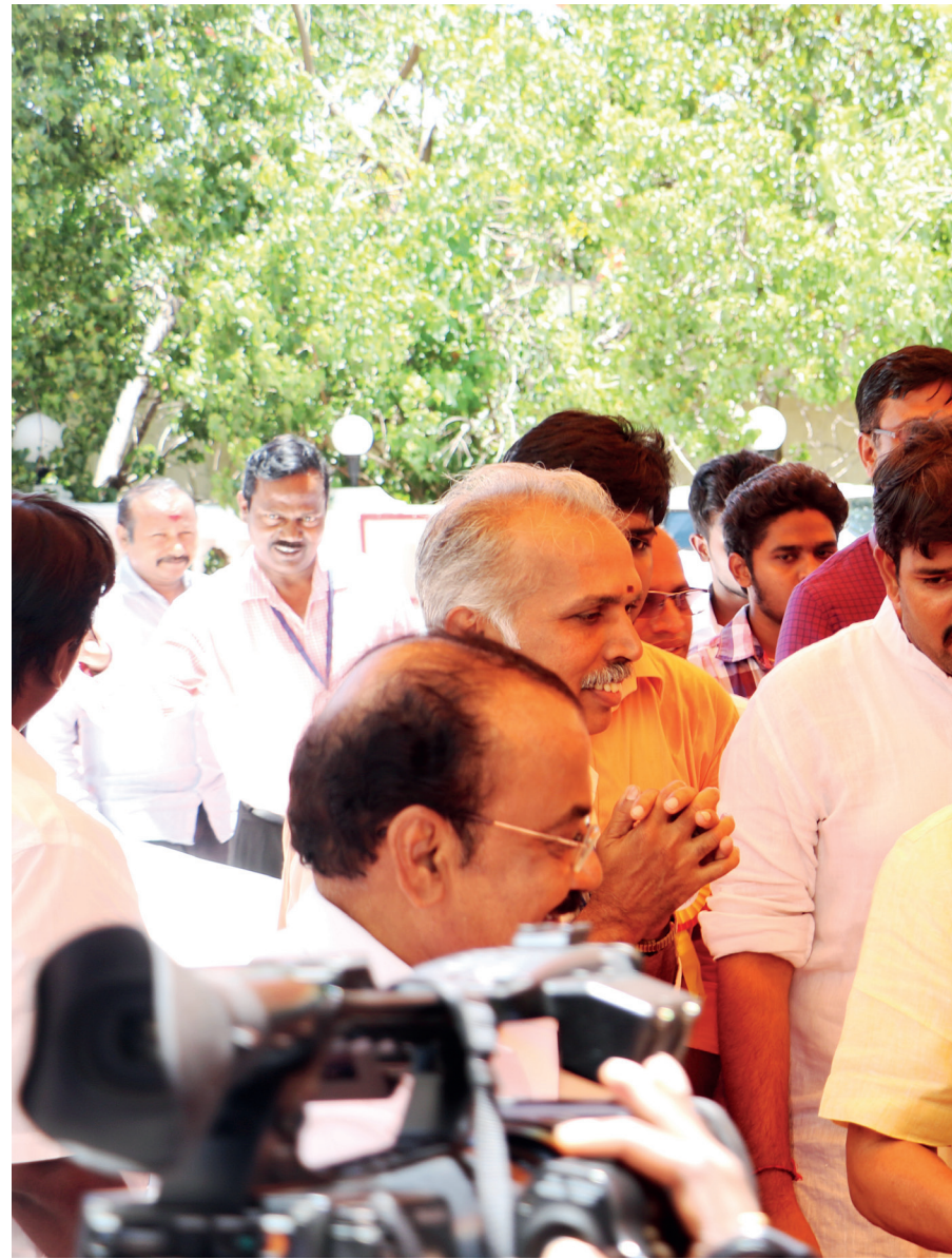
Founders Day : The Founder Chancellor honoured with a bouquet on