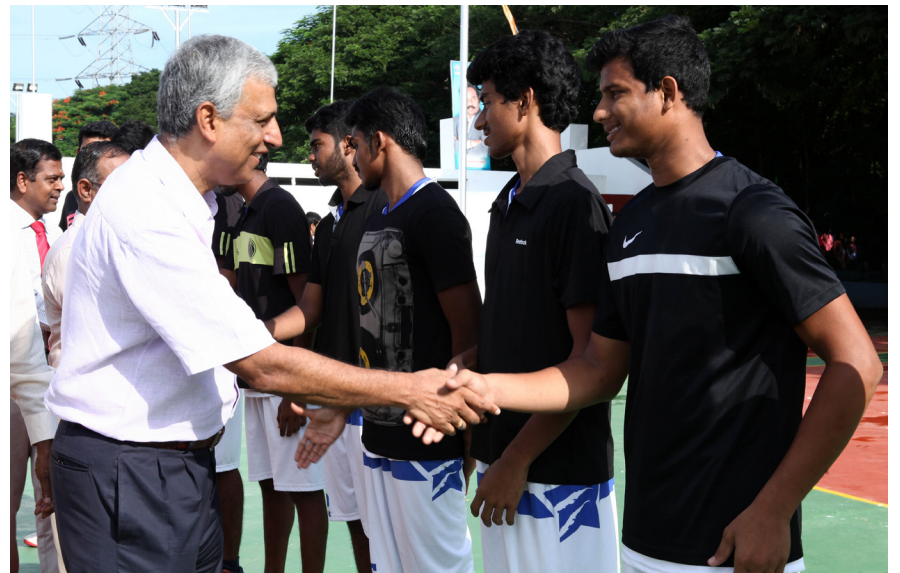
Founders Day Trophy : Our Vice Chancellor Inaugurating the Founders Birthday Trophy Basketball Tournament