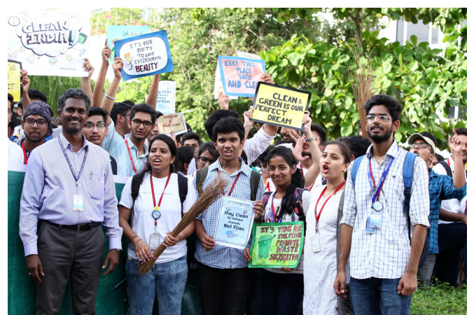
Clean India : Students initiative in promoting Cleanliness

Various cultural activities like dancing and singing songs on the theme of Clean India took place at various strategic points. The volunteers carried broomsticks and garbage bags with them to clean up trash lying around the campus, and cleaning all the roads and play grounds in the campus.