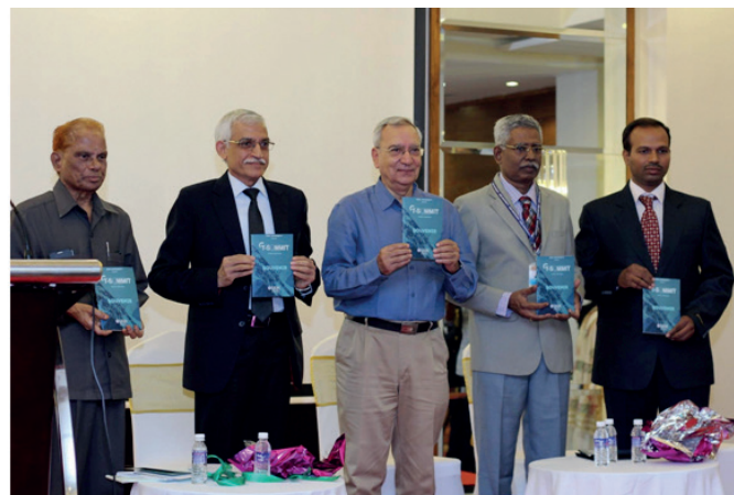
T-Summit : Chief guests endorsing the first ever conference