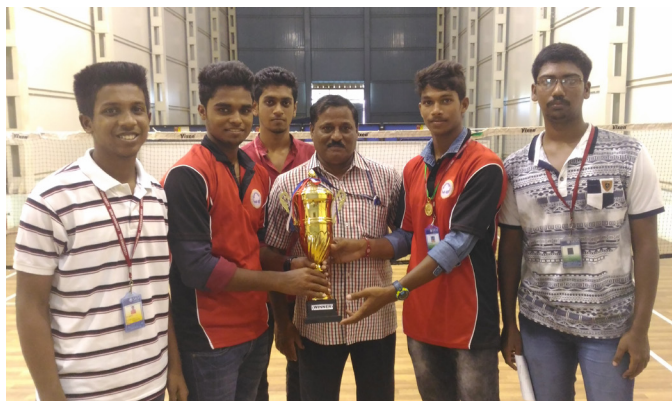
SSN Trophy: Badminton Team winning the All India Inter Colleigate