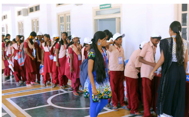
Butterflies : School students lined up outside the T.P. Ganesan Auditorium to take part in the events

The children were brought to campus from their respective schools and were welcomed warmly with refreshments. Then it was a fun filled day with a