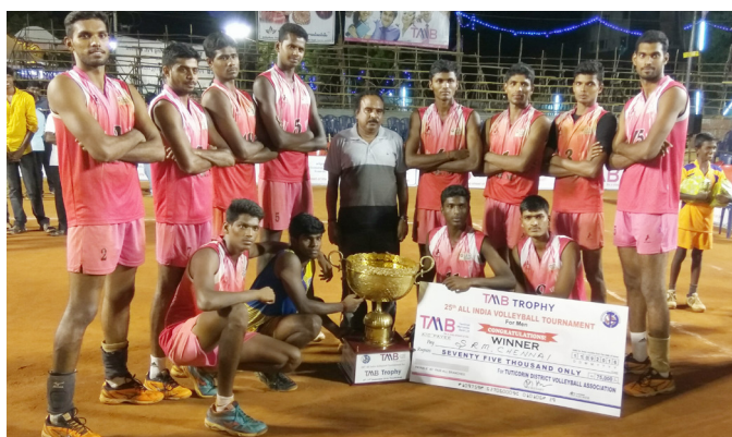
TMB Trophy : All India Volleyball Tournament Winning Team