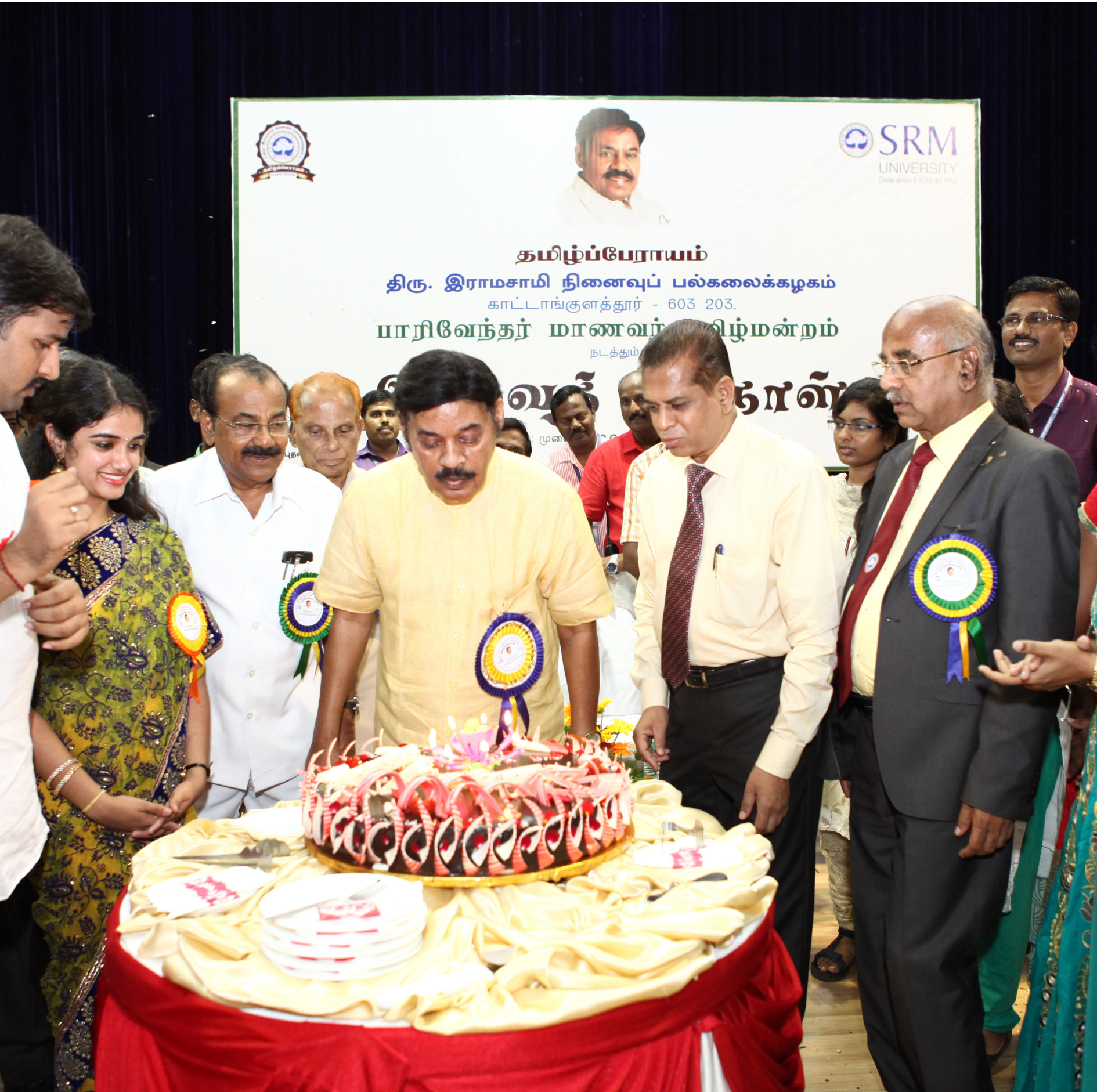
The Director, FSH, the Pro-VC, Director, IHM, The Registrar and the Estate Officer watch as our Founder Chancellor celebrates his Birthday