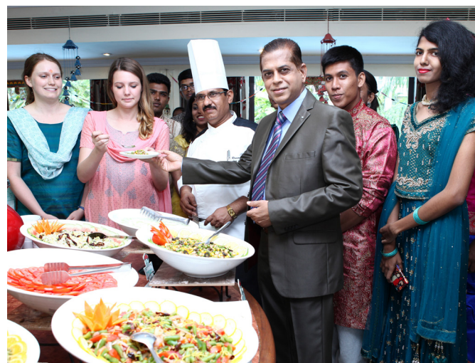
SRMIHM : Mouth watering Maharashtrian food festival