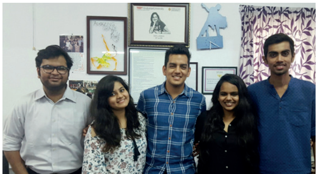
The Climber : Executive Board of the Chennai Chapter of The Climber

The Climber now holds its operations over 11 cities across India and is completely youth run "