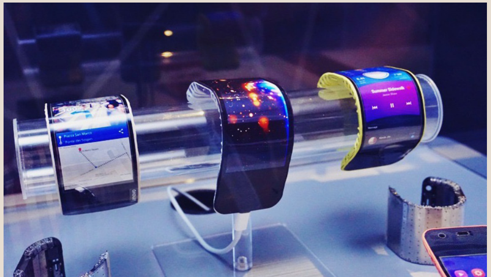
A prototype of the Lenovo CPlus