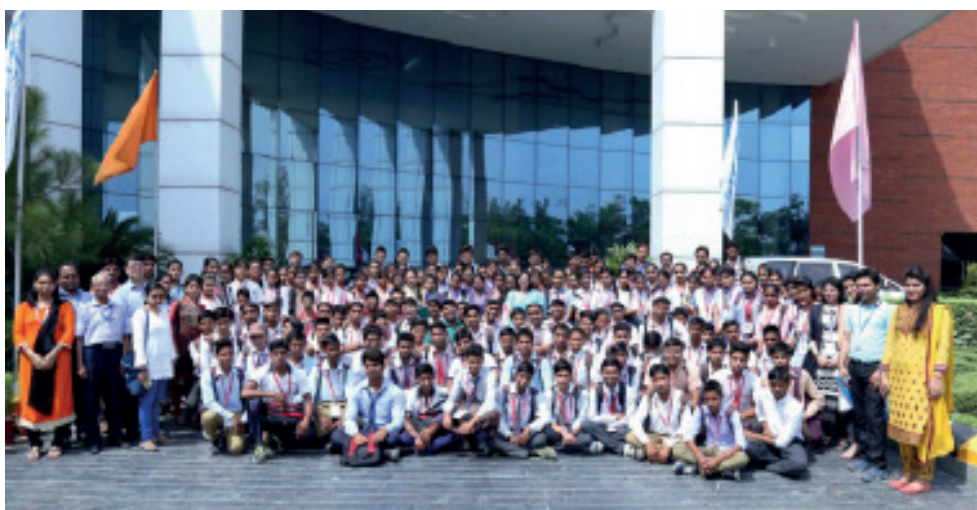
Inspire : Department of Science and Technology