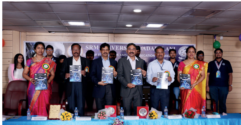
Abhigyan : Inaugural ceremony of the technical symposium