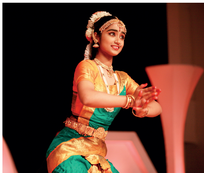
Shuru : Showcasing explicit talents through the amalgamation of astounding art forms