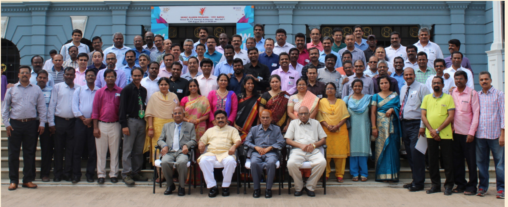
Coming back to the Alma Mater : Reunion of 1991 batch at SRM University