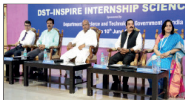
DST Inaugral Session

equipment and watched technical presentations and 3-D shows to be more creative and ardent to pursue scientific research. Different types of programmes like Road Show, Robo Show, Group Discussion, Poster Making Technical Write-up and cultural activities were organised to invigorate and synergize the participants.