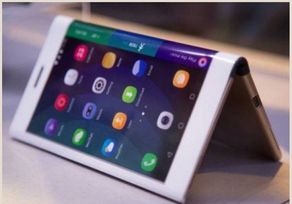
The Lenovo Folio foldable tablet

similar to the idea of searching and exploring the world around you for secrets in Ingress. Just like in the old pokémon games, you are presented with three options, this time being the original three, that are 'Bulbasaur', 'Charmander' and 'Squirtle'. But here's a secret, you can get everyone's favourite Pikachu by not selecting any of the first choices and strolling until you see one. Moving on to the gameplay, when you encounter a Pokémon, you can catch it by throwing a pokéball by swiping your screen. You can get more pokéballs at pokéstops, which are basically random landmarks in your city. The game has gyms where you fight it out with other trainers to represent your team as a leader. The three teams are: Team Instinct, Team Mystic and Team Valour. So charge up your phones, put on your shoes, grab that cap and embark on your very own quest to catch em' all!