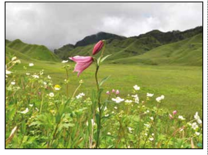
The rare Dzuko Lily in Dzuko valley of Manipur

The region provides a platform for raw adventure and tranquility. If you are looking for an unforgettable, once in a lifetime experience the North-East is the perfect destination for your holidays.