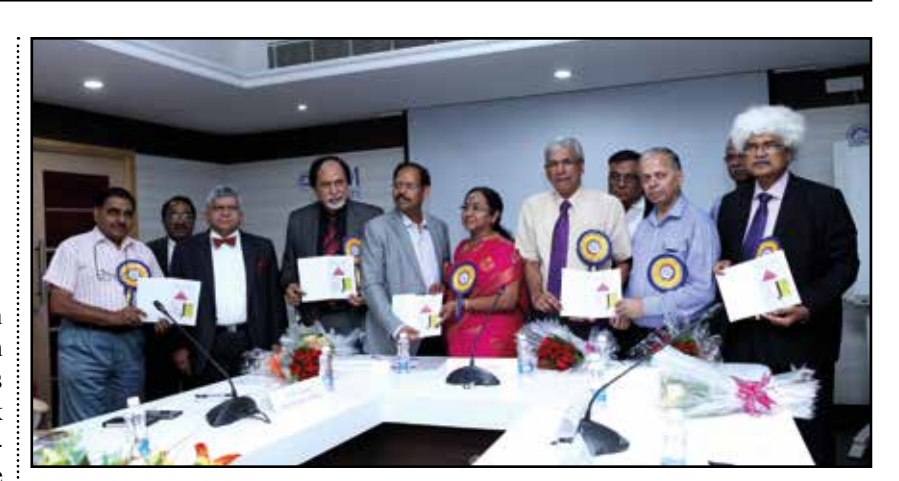
The members along with the bioethics model