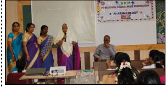
competation in progress

All the delegates actively participated and interacted during the sessions. The feedback received was excellent from the audience.