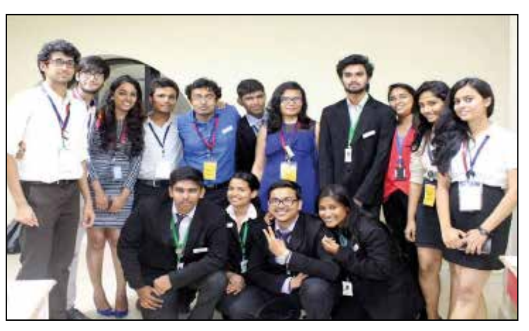
The TUC team, volunteers and Liason Officers who organized the event

So go ahead, vote and let your voice be heard.