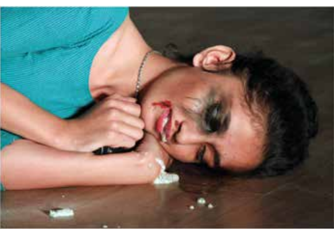
One of the performances at Tarana

declared the runner up. The Best Club award was bagged by the Aeromodelling Club. With this, DSA wrapped up another eventful academic year