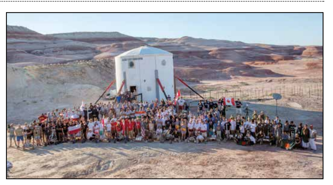
The competator at the robotic event

This year the criteria of competition was totally different, as there was first a semifinal round