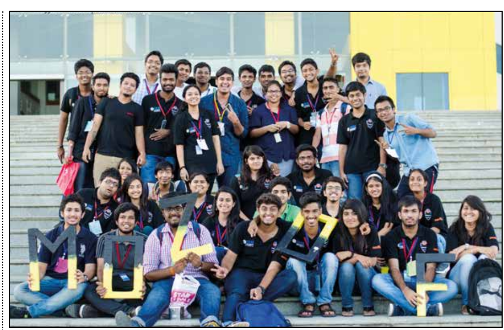
The team that made it all happen – SRMKZilla team.