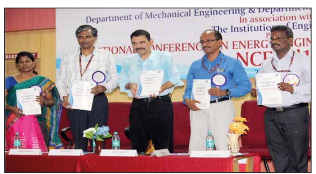
The Diginatries at the conference

The chief guest in his inaugural address encouraged the participants by his words of motivation and shared his ideas on the current energy scenario in India. The National Conference proceedings was released by the chief guest and received by other dignitaries. Papers were presented in three technical sessions and one best paper from each session was selected and prizes were awarded by the Vice Principal(Academic) at the valedictory function. At the