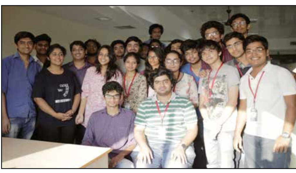
The participants of the course posing for a group photo after a productive day.