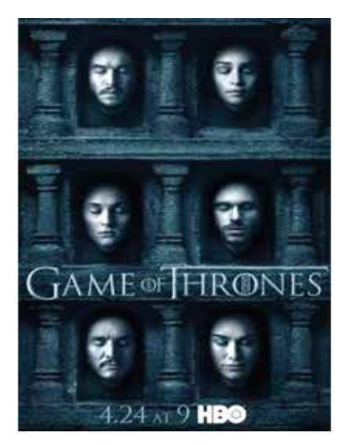
Poster of GOT Season 6

The possibility of John Snow's resurrection as indicated by the trailers seem to be one of the talking points of this season. Arya Stark and the apparent (rather incomprehensible) death of the God of Faces, Marcella's murder, Sansa's escapade with Theon and the rise of the White Walkers have left us preoccupied about what Season 6 has to offer. And yes! Let's not forget