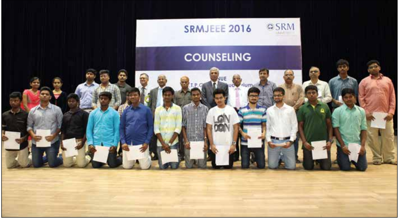
The students with their scholarship awards

Students from all states of India and Union Territories evinced keen interest in pursuing their Under Graduate degree at SRM University's Counseling for B.Tech courses. Statistics