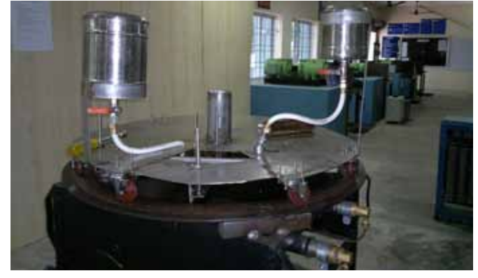
The Dosa Maker

As of now, the dosa maker is a prototype but there is a plan to manufacture the product on a large scale once the machine reaches perfection. Eventually this is expected to give rise to a huge chain of street vending dosa machines, replicating the same taste, hygiene, and low-cost dosas for the common Indian, an attempt to go one up against hunger and poverty rampant across the country.