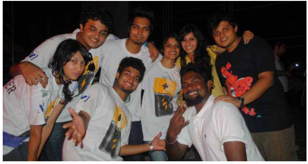
Enthusiastic students of SRM University

Enthusiasm of the crowd reached fever pitch levels at the commencement of Launchpad, as music lovers headbanged to semi-pro metal and rock bands. A rather skewed debate ensued on 'Indian women who don't