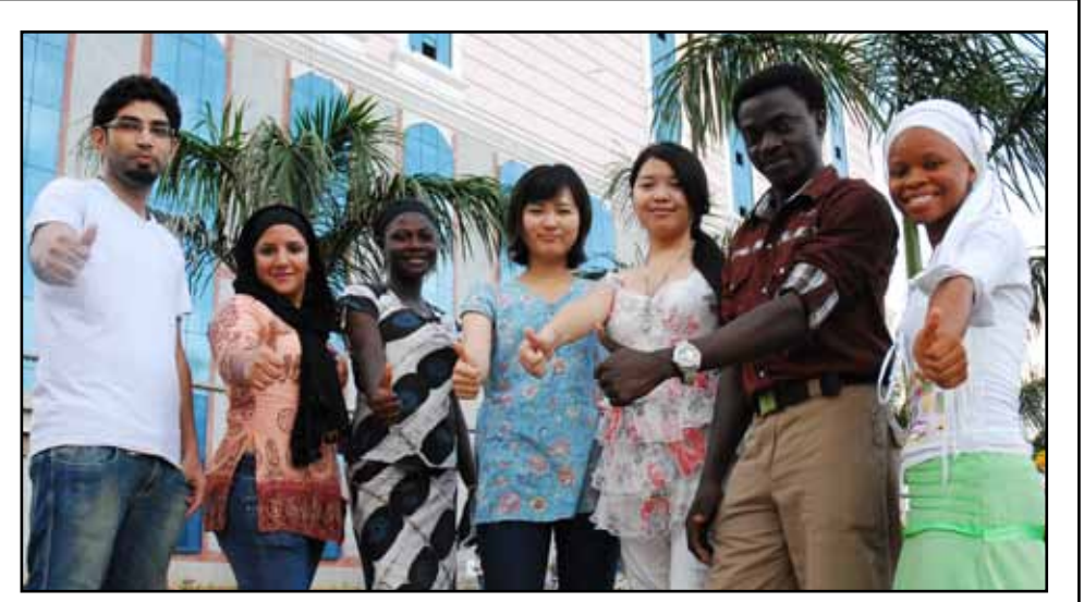
A Small sprinkling of international students