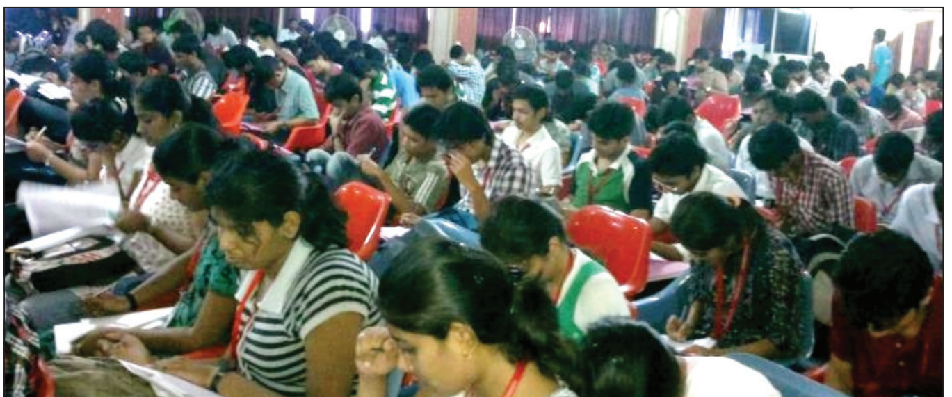
Students picking their brains in IMF-2012