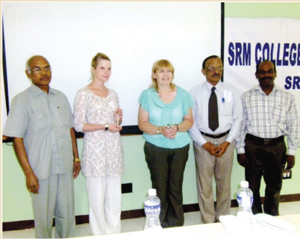
The International delegates with the Pro-Vice Chancellor, Medical