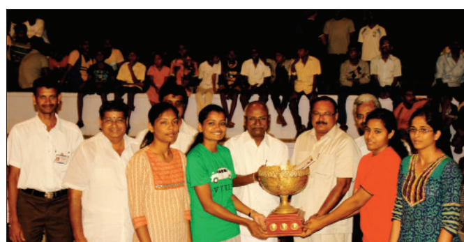
The teams with the Kongu Trophies