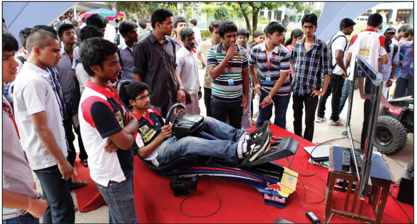
Students participating in Aaruush'12

Aaruush began with an inter-school quiz- ‘Swastika’ being conducted in schools in six cities across Tamil Nadu with participation of over 500 students. Another event which saw over 360 participants was the Sports Week where students of the University competed in various sports such as basketball, cricket, tennis and badminton. A Computer Aided Engineering Workshop on computer based designing software was conducted by the Conrods and Camber Racing team in association with Aaruush Konvolve, an inter-departmental multi-disciplinary project competition which was also conducted preceding Aaruush. With over 12 road-