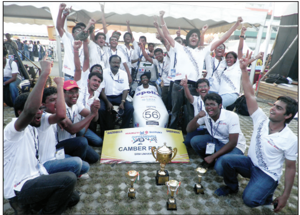
The team Apollo camber racing - champions of SUPRASAE - 2012

The competition consisted of various events spread over four