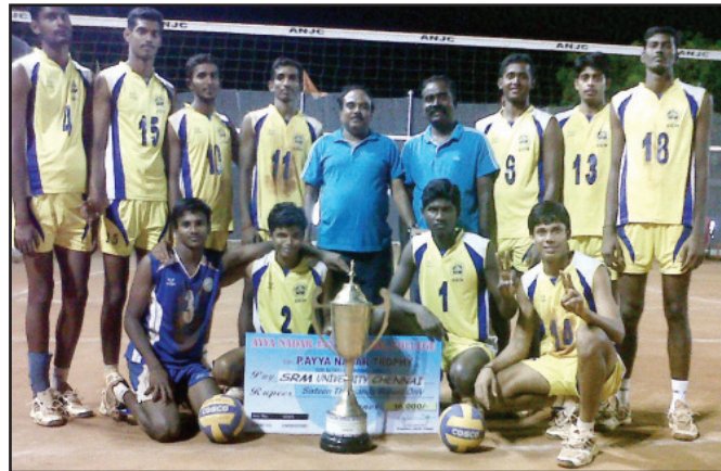
The winning team with the trophy