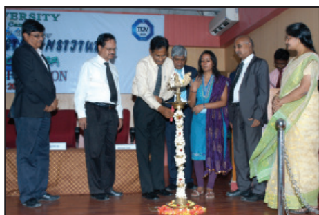
ICI Secretary Inaugurating the 'Students Chapter'