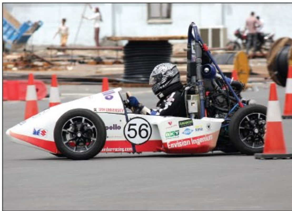
The LJM 2.0 - by Apollo camber racing