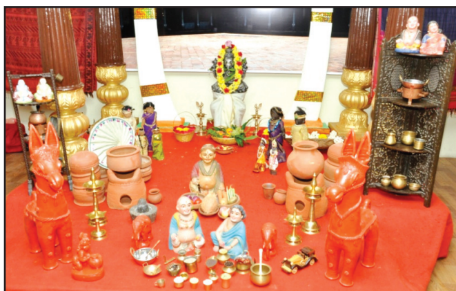
Karaikudi saras, utensils and Puppets.