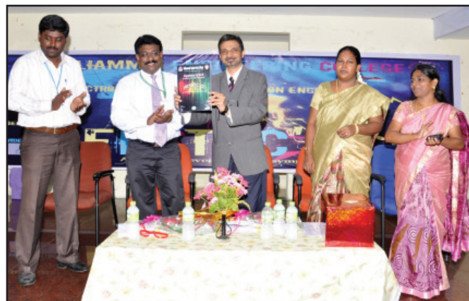
Chief Guest releasing the symposium souvenir