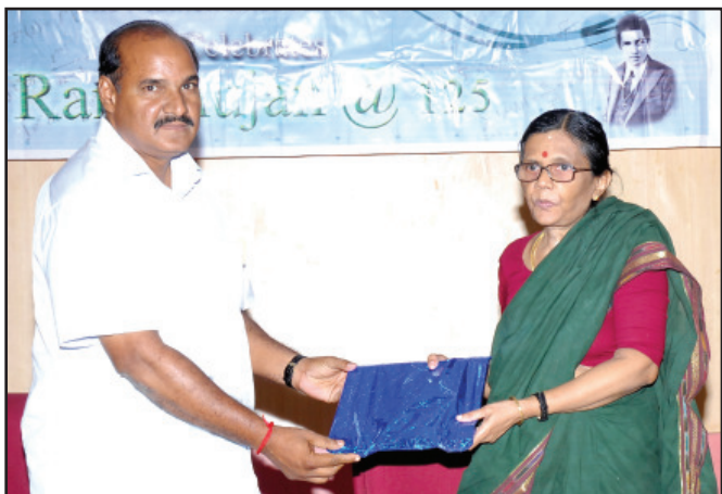
ICI Secretary Inaugurating the 'Students Chapter'