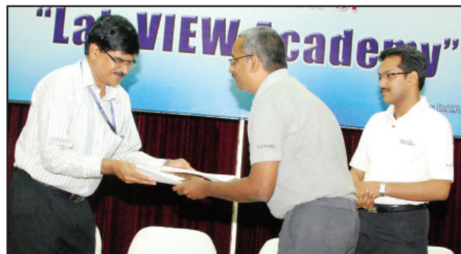
Representatives from National Instruments seen here with director E&T

NCETICT 2012 saw participation from students as far away as New Delhi this year-other states being Andhra Pradesh and a good number from Tamil Nadu, including a team from SRM University. Papers from two teams stood out from the rest and were regarded as the best Papers this year. One was a team from DMI College of Engineering which presented a Paper on the Analysis of Parkinson's Disease using an Android Application and the other team was from Satyabhama University which presented a Paper on Minimizing Energy Consuming MAC schedule for Clusters of Radiation Monitoring Sensors. The team from Satyabhama had been working on this topic as Director ate of Science and Technology (DST) Project for some time and their Paper received a lot of positive reviews at the Conference.