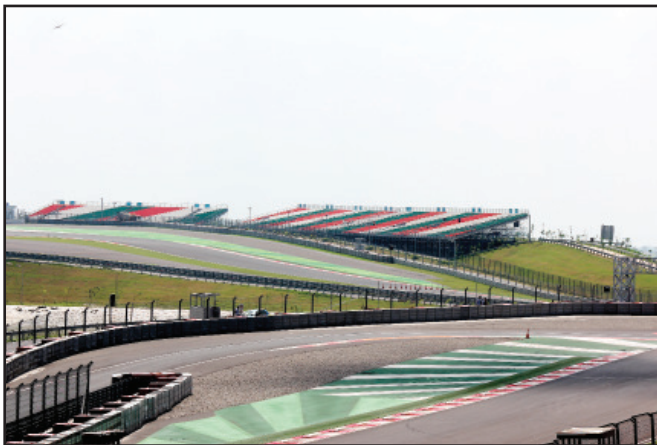
The Buddh International circuit Greater Noida

With the aim of defending the title, the team has already recruited fresh talent among the second years and is set to repeat history in SUPRASAE-2013!