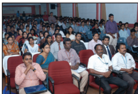
Audience at a glance