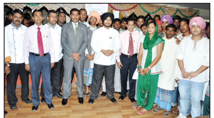
SRM IHM Students in traditional Dhaba costume

The students donned the traditional Dhaba costume of kurta, lungi and the turban as headgear.