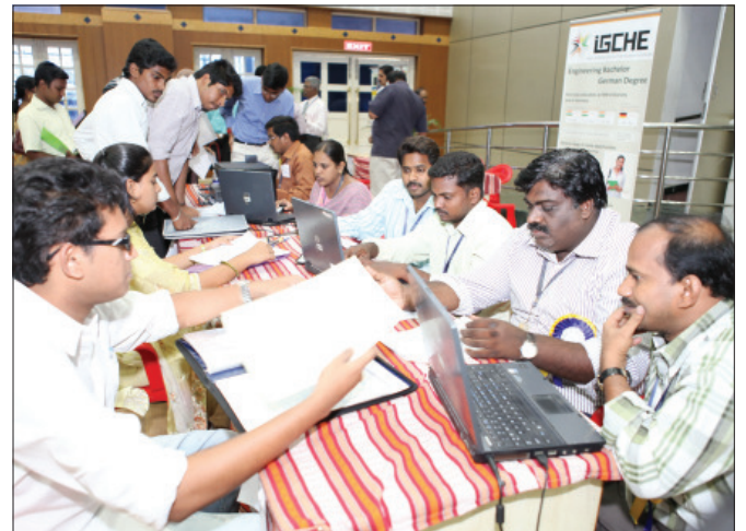
Student interacting with faculty