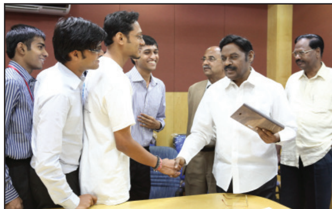
The Chancellor interacting with students