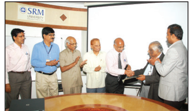
The Registrar of SRM University exchanging the MoU documents.