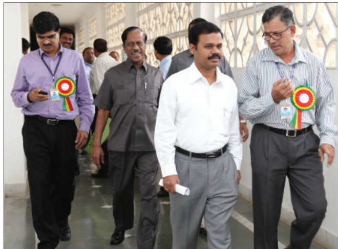
The President of SRM University at the Counseling session