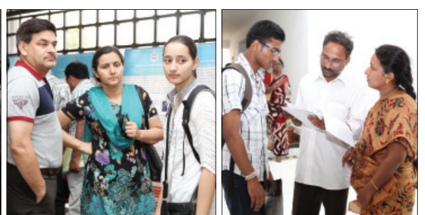
Parents and their wards at the T.P.Ganesan auditorium