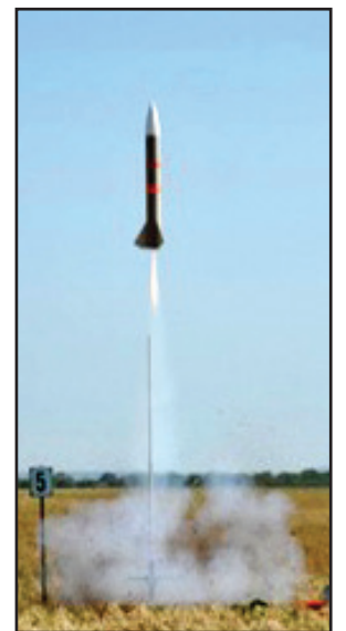
The CANSAT launched at Burkett, Texas