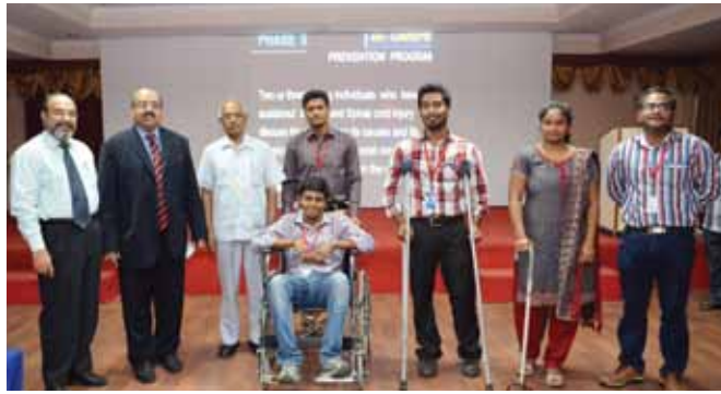
Participants of the Road Safety Programme

According to Dr. K. Gireesh, Deputy Dean and Vice Principal of SRM Medical College, Traumatic Brain and Spine injuries are a major public health problem imposing a greater burden on modern society than other diseases that are most preventable of the major public health problems. No society can afford the loss of young life as well as the high cost of medical treatment of head and spinal cord injuries and cost of supporting those permanently disabled by these injuries. As a Neurosurgeon treating the individual one becomes frustrated, depressed at how little one can do to improve the neurological deficit especially following severe head injury. With the most aggressive therapy for severe head injuries if a person escapes the clutches of death then he is left with a permanent neurological deficit or he will be in a vegetative state unfit to mingle in the society and a burden to the family. Therefore it is logical that the Neurosurgeons should take active role to prevent these injuries. And also Dr.K.Gireesh explained that awareness of importance of wearing helmet for two wheeler riders should be