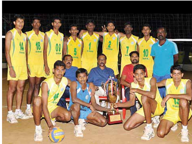
SRM's winning team in CMJJ Trophy

The C.M. JJ Trophy, All India Inter University Volleyball men and women Tournament was held at Thiruvananthapuram from 14th-17th March, 2013. In the league, SRM beat Mysore University (25/16, 25/14, 25/14), Bangalore University (25/14, 25/16, 23/25, 25/18) and Vel's University (21/25, 27/25, 25/19, 25/16). Our varsity came out on top at the semi-finals beating Sathyabama University (25/14, 20/25, 25/20, 25/18). Finally, we bagged the champion's title by defeating Calicut University in the finals (25/18, 25/19, 25/21).