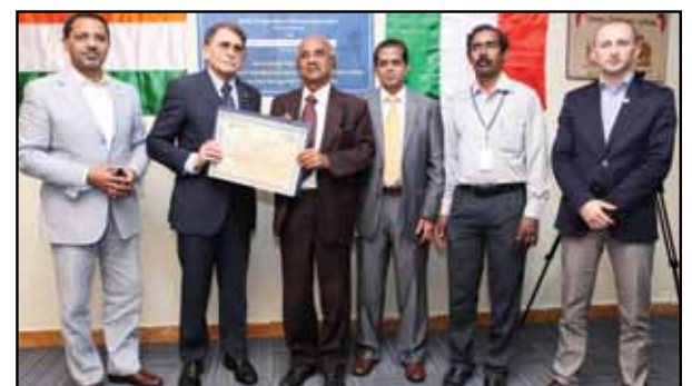
MoU with ALMA School for Italian Cuisine

He further said that the food and hospitality industry was constantly changing and the demonstration was to encourage students to understand and cope with global trends.