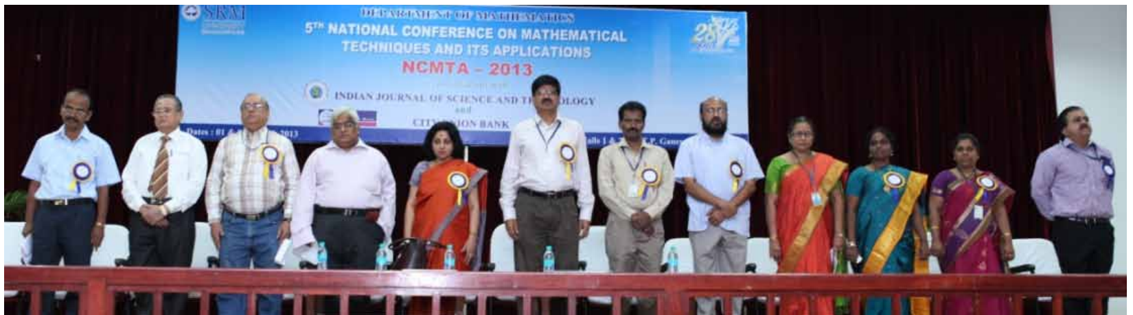
Inaugural function of NCMTA 2013