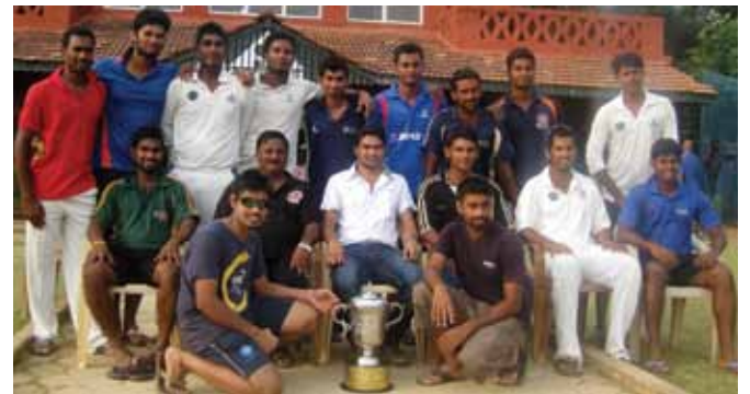
Winning team at IIT Sanmar Cricket Tournament

The IIT Sanmar Cricket Tournament, 2013 was held by IIT Madras from 13th-21st March, 2013. In the quarter finals, SRM University (171 for 2) defeated SSN College of Engineering (170 for 4) in 30 overs moving on to the semifinals. Here, SRM beat Vivekananda College (223 for 4 and 171 for 7 respectively). Finally, our varsity bagged the 1st place by defeating Hindustan University (233 all out in 48 overs) in the finals.