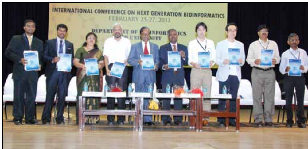
Proceeding release at ICNGB'13 Inaugural Function