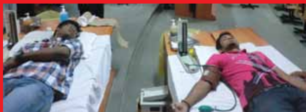
Participants of the Blood Donation Camp

Though people have different views, this new trend for men and women is expected to blow off the fashion era with the exquisite new colours and the styles that make us look all the more impressive and stylish.