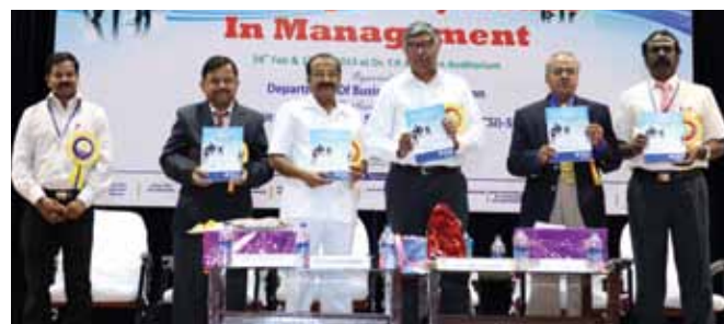
The panel of speakers and Director, FS&H during BIZAD'13