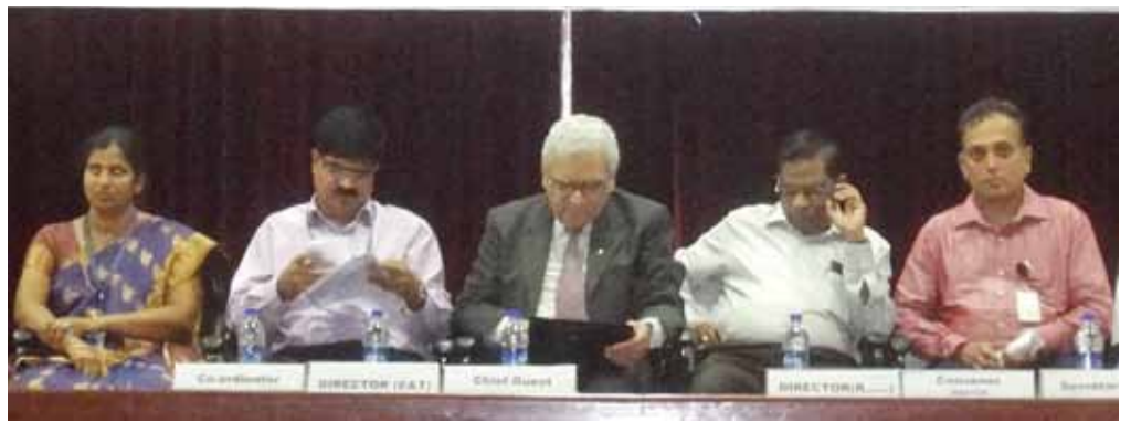
Chief guest along with the Directors and co-ordinators