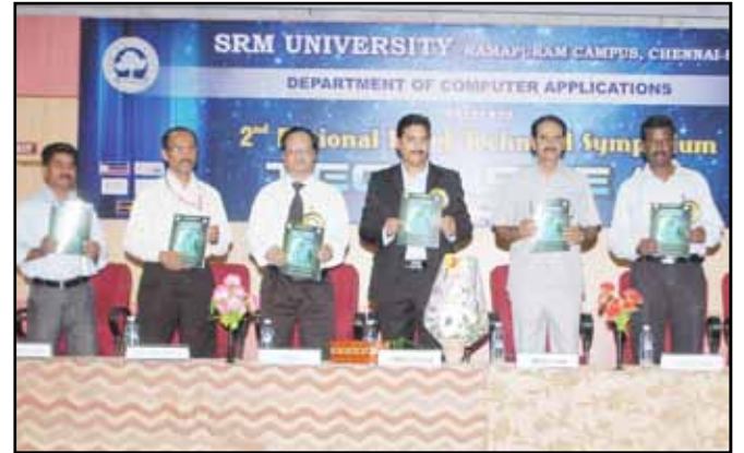
The Dignitaries on the dais release the proceedings of the Symposium