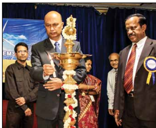
The Chief Guest with the Vice - Chancellor

About 59 research papers from various parts of the country registered for this Conference.