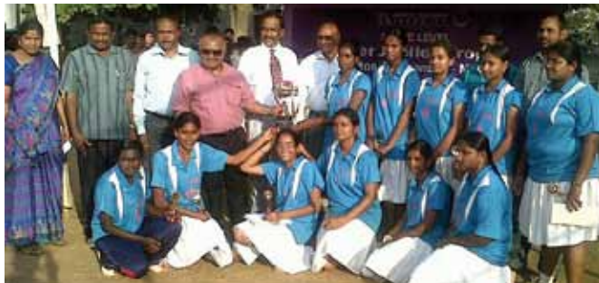
SRM's winning Ball Badminton women's team

SRM University, Kattankulathur campus will be conducting trials for selecting students under sports quota for the year 2013-14 from 16th-17th April, 2013. The trials will be held for the following games- Cricket, Football, Hockey (men), Basketball, Badminton, Ball Badminton, Chess, Table Tennis, Tennis and Volleyball. All sportspersons with a proven record of achievement in any level and seeking admissions to degree programmes in the Faculty of Engineering and Technology, Science and Humanities and Management may report for the trials with their certificates and testimonials.