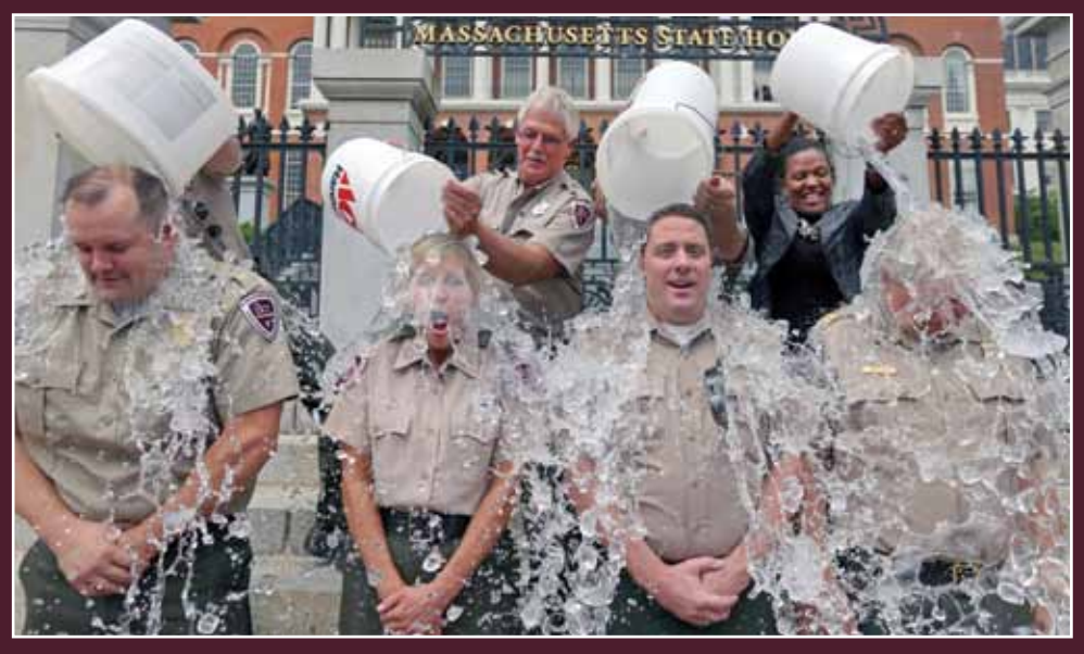
The ALS ice bucket challenge has become a viral sensation around the world while raising money for an important cause.

SRM students too have shown enthusiasm and joined