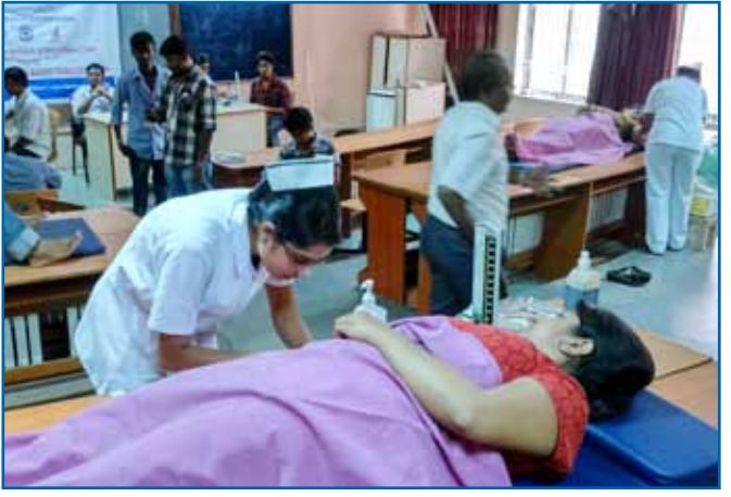
A blood donation camp was recently held at SRM Kattankulathur to celebrate the Founder's birthday.

Centre blood bank conducted the camp. Students from F/S&H turned out in big numbers to contribute to this social cause. The camp was organized in a much disciplined manner checking each and every aspect of participant's health. During the blood donation process, the hemoglobin content of the participants was checked before donating the blood, clearly telling the participants about their health condition. Many checkups for blood pressure and other tests were conducted by the doctors. Among 130 students attended the camp, 102 Units of blood were collected. The donors were given refreshments and a certificate of appreciation. We hope that even in the future N.S.S of Faculty of Science and Humanities will continue to render support to such social causes and help humanity in all the ways we can.