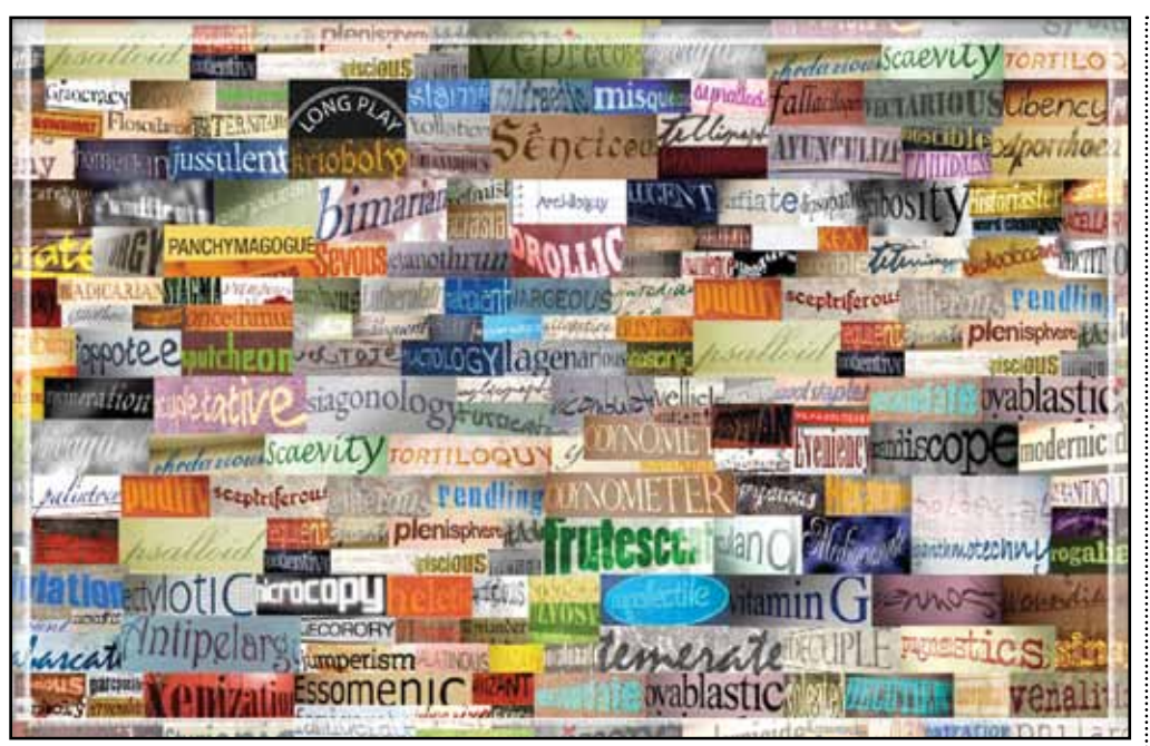
Many words that were integral to the English language have now become a relic of the past.