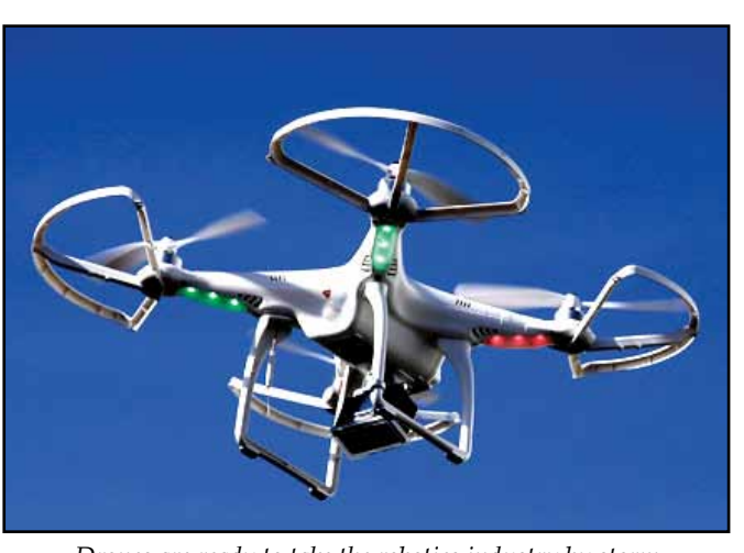
Drones are ready to take the robotics industry by storm as their use in civilian applications continues to grow.

they are referred to by the International Civil Aviation Organisation (ICAO), are primarily used for military purposes. Drones however, also find application in a host of other fields. A little-known Indian pizza delivery company in Mumbai succeeded in making The use of drones is limited commercially not because of but because of the legal terms Aviation Administration) which takes responsibility of the