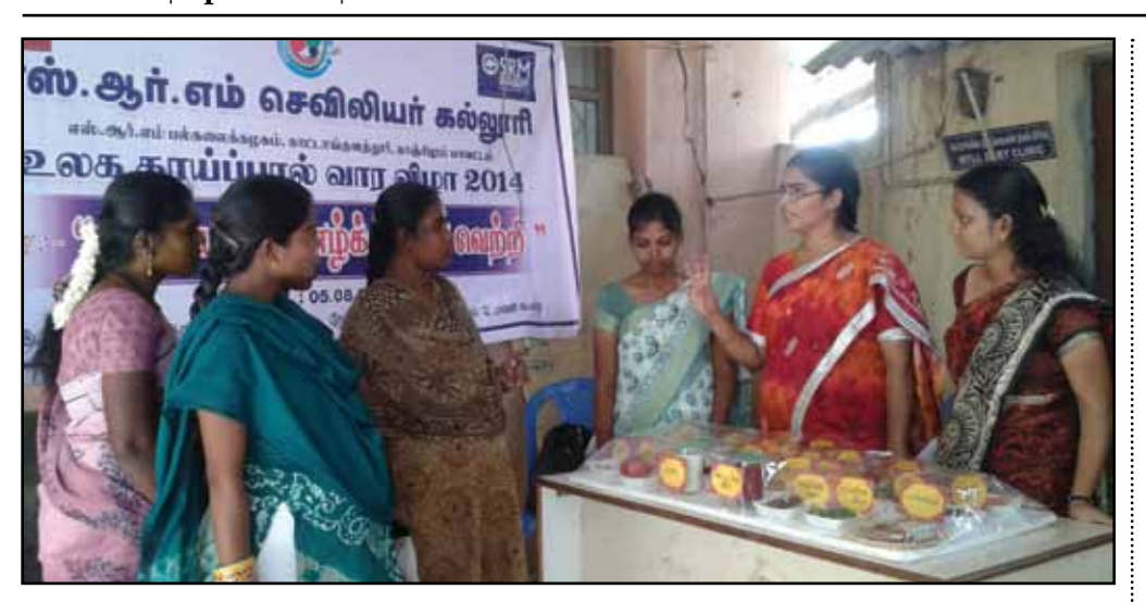
Women attend an exhibition by the Department of Community Health, Nursing and Pediatric Nursing at Guduvanchery PHC.