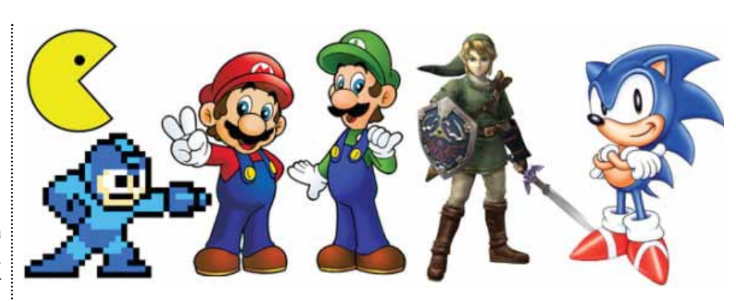
Assessing the roles video game characters would take on in college.

True to its name, Aaruush'14 is all set to rise: a new dawn of technology and innovation, to reach beyond the horizons, towards infinity.