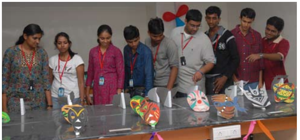
Students going through the exhibits.