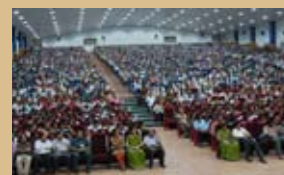
New life... 7