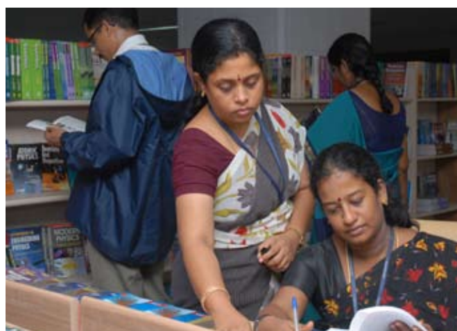
Students and faculty Members browsing.