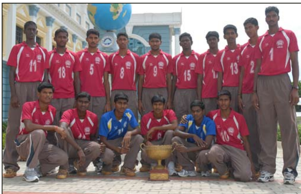
Kongu Trophy Winners : (Left) Women's Basketball Team, (Right) Men's Volleyball Team