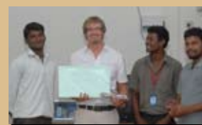
I will not... 10