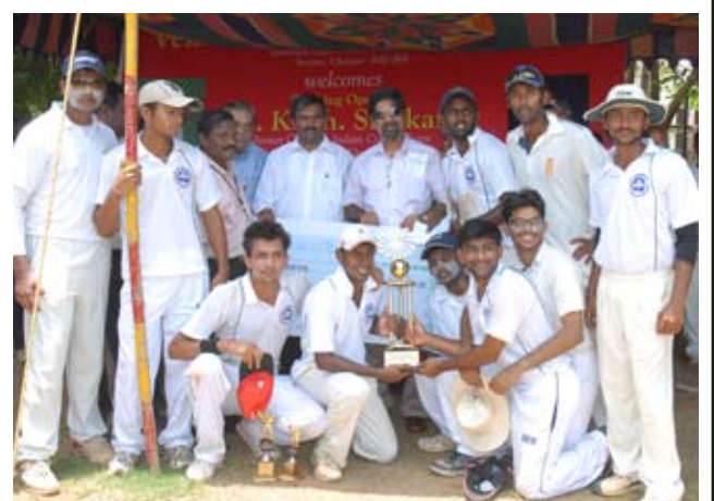
The Team posing with India's ace K.Srikanth