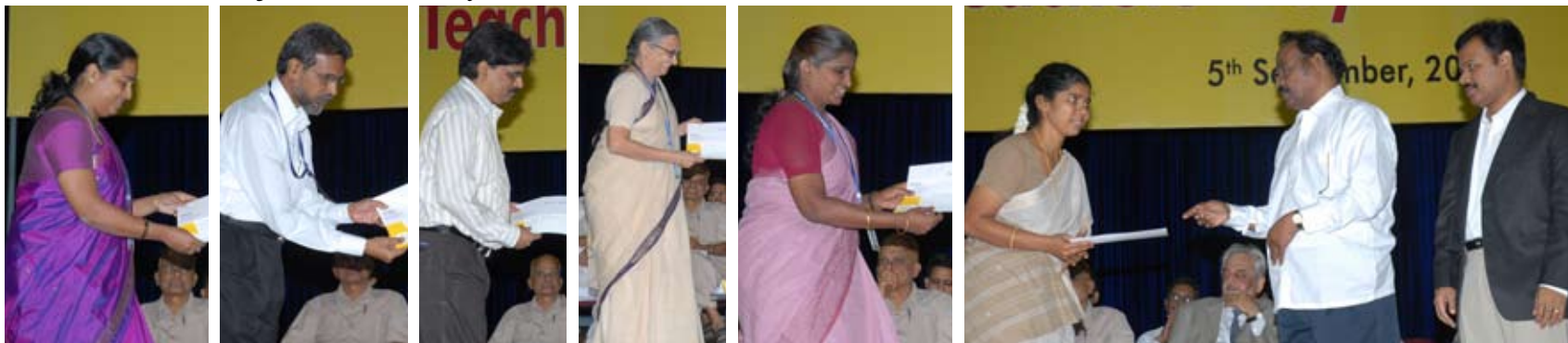
Honouring SRM Faculty on their achievements