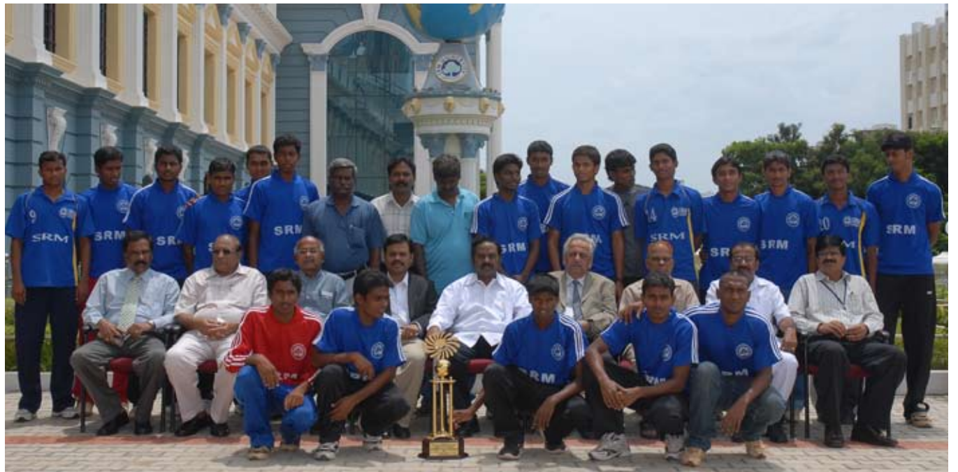
The Chancellor, the Vice Chancellor and other top University officials with the football Champions

On the way to the final, SRM beat Nazerath College of Arts Science 2-0, YMCA College of Physical Education 4-2, Agrasen College of Arts Science 3-0 and St Joseph's College of Engineering 1-0.